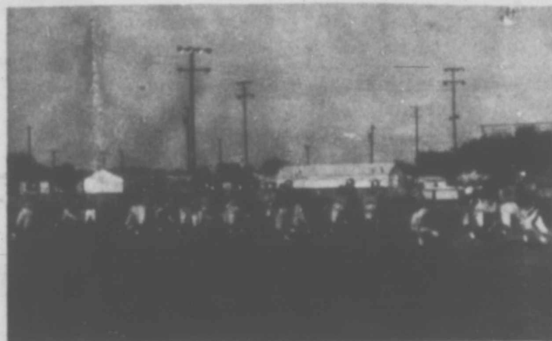
FOOTBALL SEASON IS HERE - Shown above is an action shot taken during the scrimmage game between Sudan and Idalou Friday night.

The Sudan Hornets will have a scrimmage game with the Whiteface Antelopes here tomorrow, Friday, with the B team game beginning at 6:30 p. m. to be followed by the varsity.