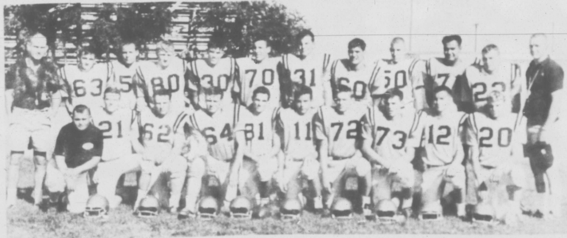
1966 SUDAN HORNETS