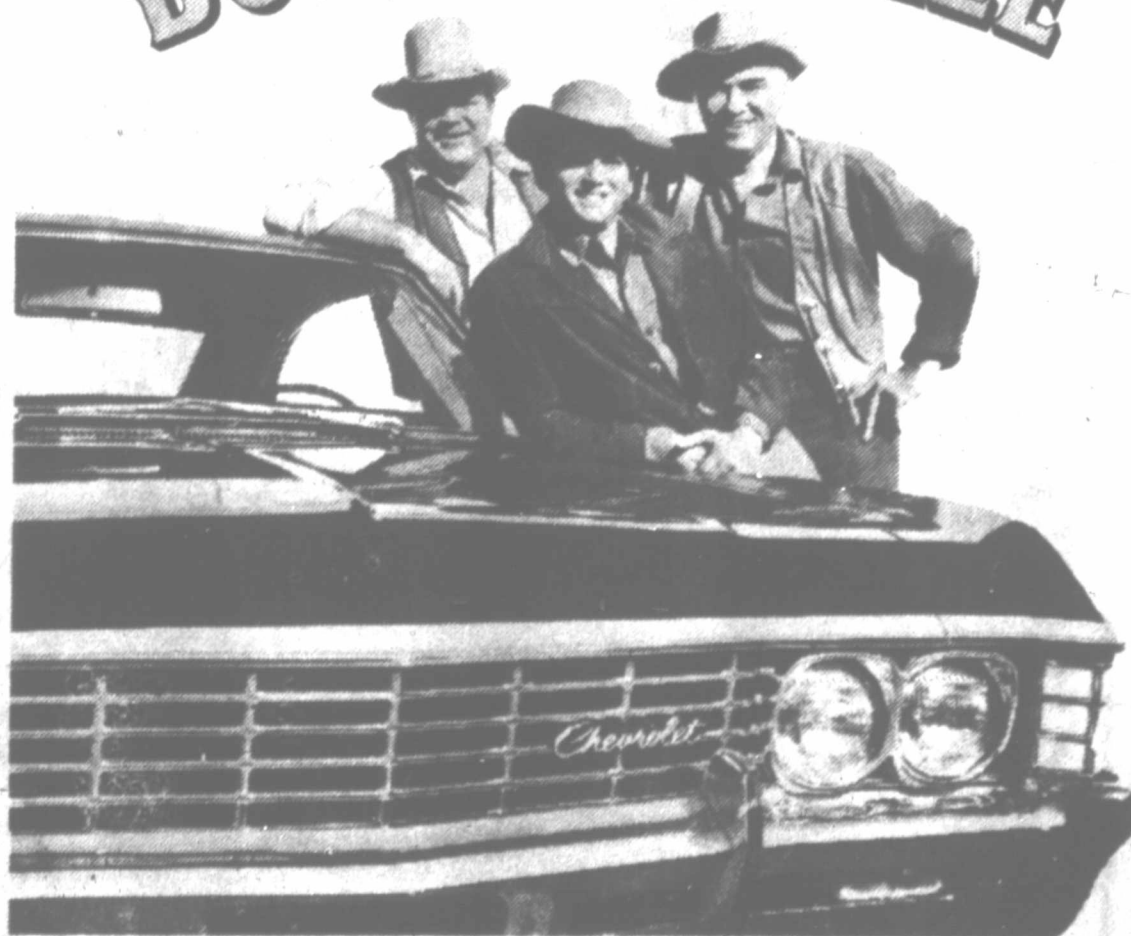
Watch Dan Blocker, Michael Landon and Lorne Greene, stars of Chevrolet's "Bonanza", on NBC-TV next Sunday night.