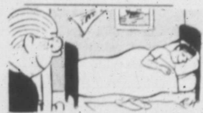
"Your dreams will never come true if you oversleep."