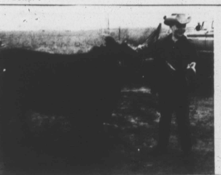
Reserve Champion - Jimmy Fields with his Reserve Champion Angus calf.