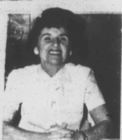
BY HAZEL HOUSE

Scripture: Isaiah 40: 25-31; 41: 4-10; St. Matthew 10: 38; and St. Luke 19: 10.