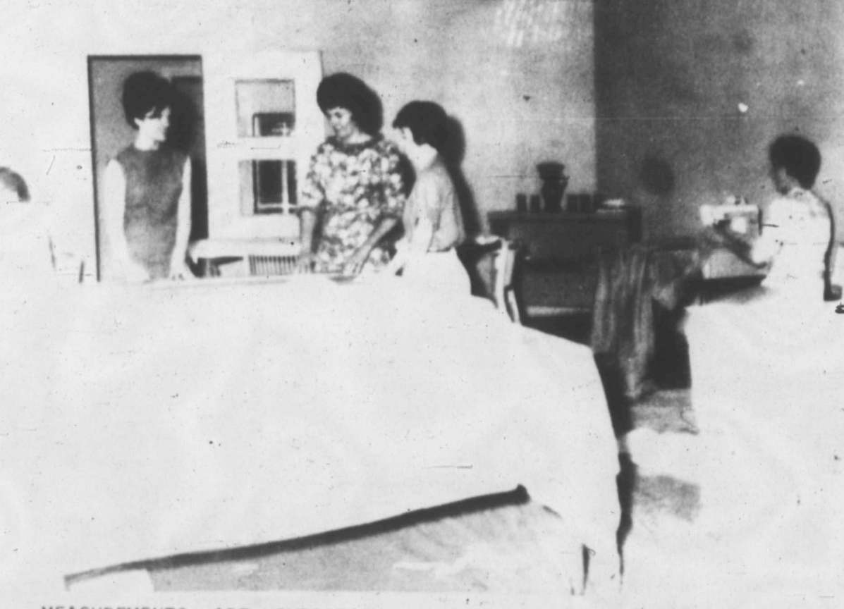
MEASUREMENTS ARE IMPORTANT as any person who sews will tell you, but the women of the summer sewing course became very skilled in measuring and making drapes. They group completed drapes for the living room and dining area of the Homemaking Cottage.

All members and other interested persons including Sunday school classes, clubs and organizations are invited to attend.