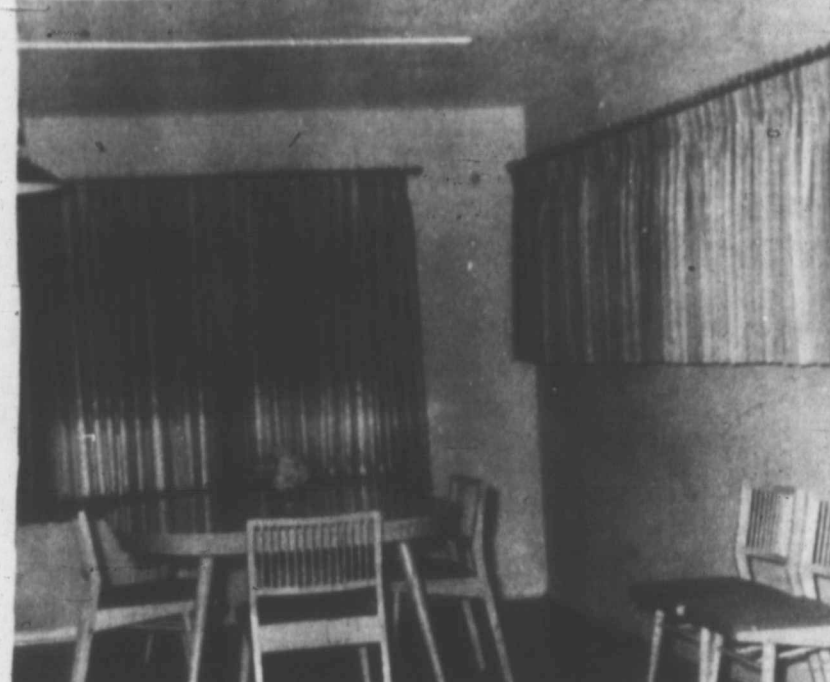
FINISHED PRODUCTS - Shown above are the drapes completed by Homemaking Summer Course for the living room and dining area of the Home Economics department.

AMBULANCE SERVICE Phone 385-5121 503 E. 5th St. Littlefield