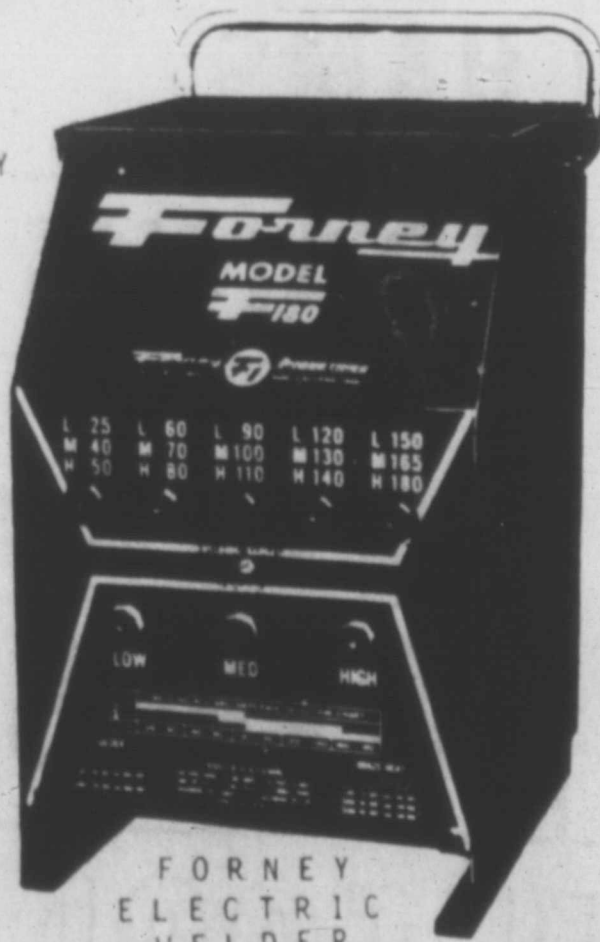
FORNEY ELECTRIC WELDER