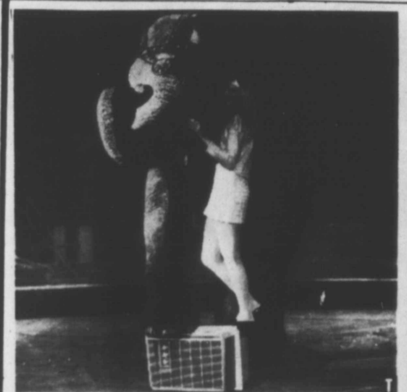
To demonstrate the strength of Lexan, a new Space-Age polycarbonate material, this elephant and pretty model stand on the Lexan case of a General Electric Fashionette room air conditioner. The elephant, a feature of Ringling Bros. and Barnum & Bailey Circus, weighs more than a ton. Lexan has 250 times the impact resistance of safety glass.