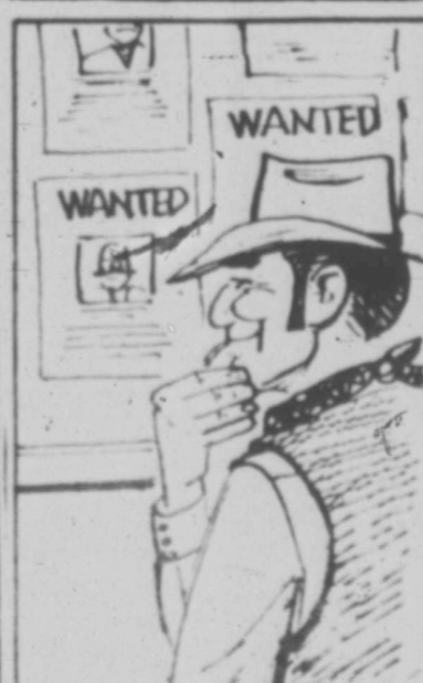
IF THEM FELLERS HAD FELT WANTED WHEN THEY WUZ YOUNG, THEY WUN'T BE "WANTED" NOW!