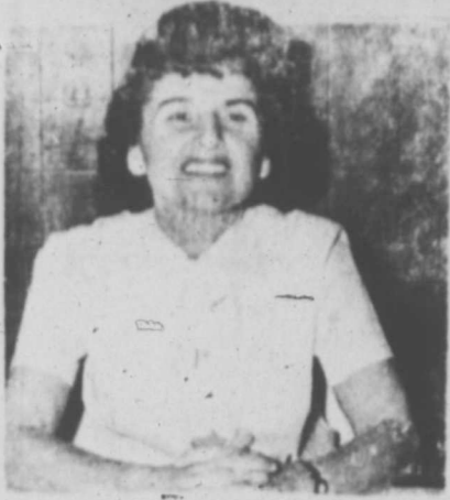
By HAZEL HOUSE