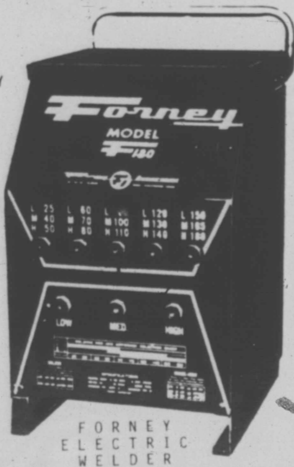
FORNEY ELECTRIC WELDER

WE NOW HAVE A COMPLETE LINE OF WELDING SUPPLIES & ELECTRIC WELDERS