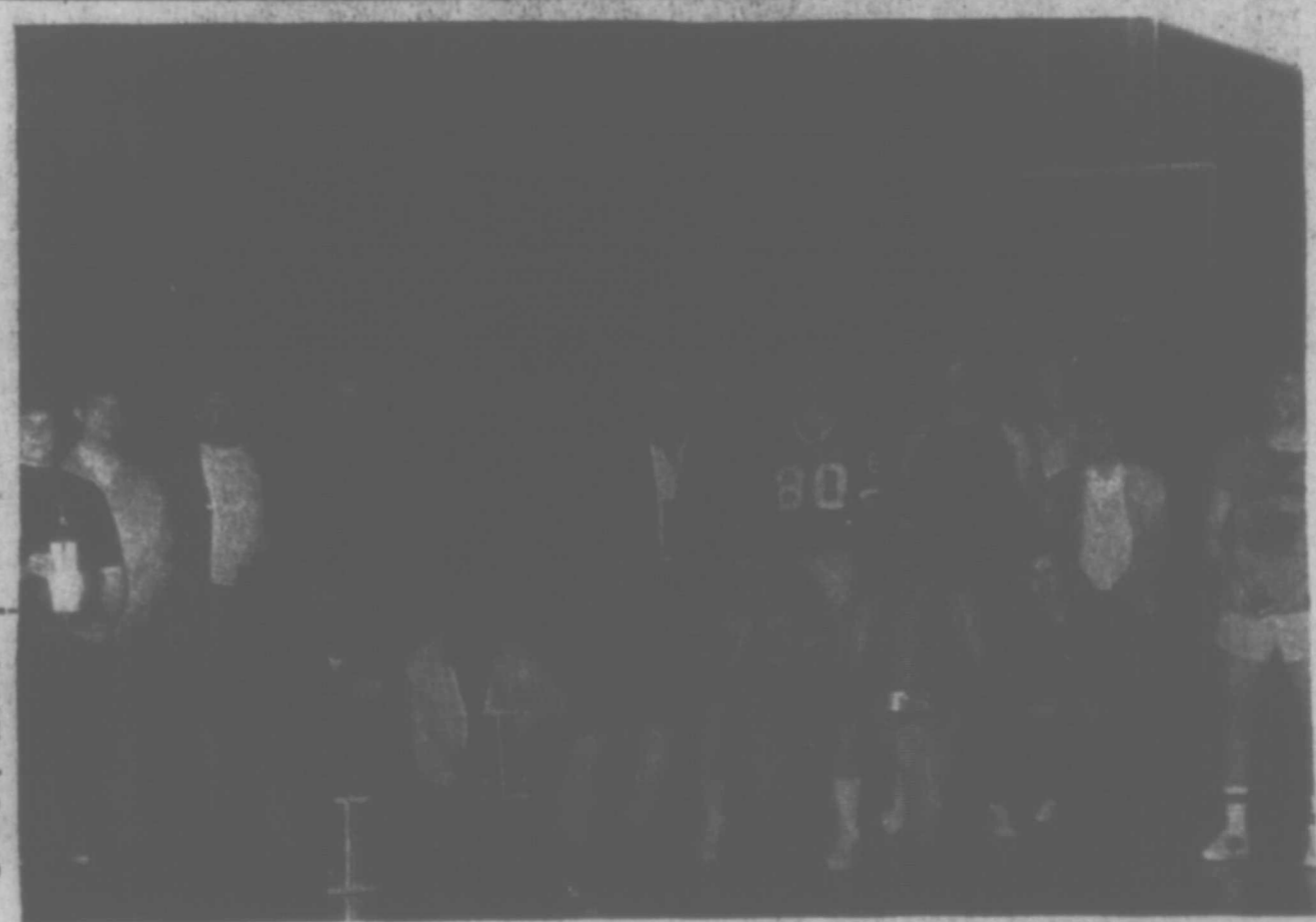
TROPHY WINNERS FOR THE OUTSIDERS BASKETBALL TOURNAMENT