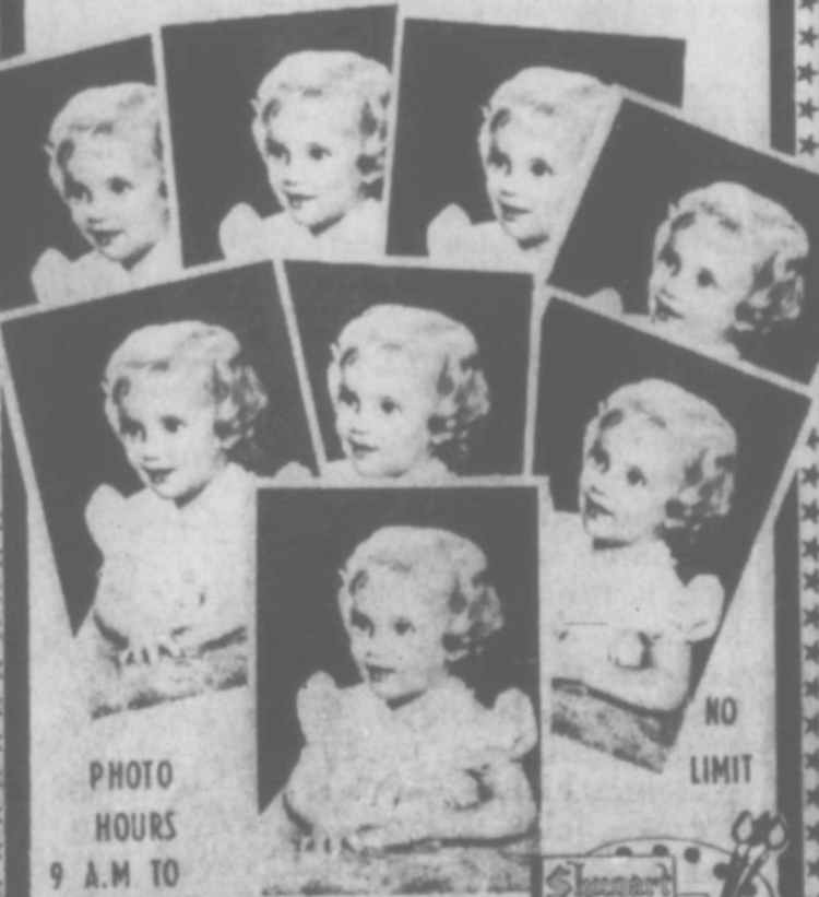
PHOTO HOURS 9 A.M. TO CLOSING

KING SIZE WALLET CREATIVE COLOR PORTRAITS FOR ONLY