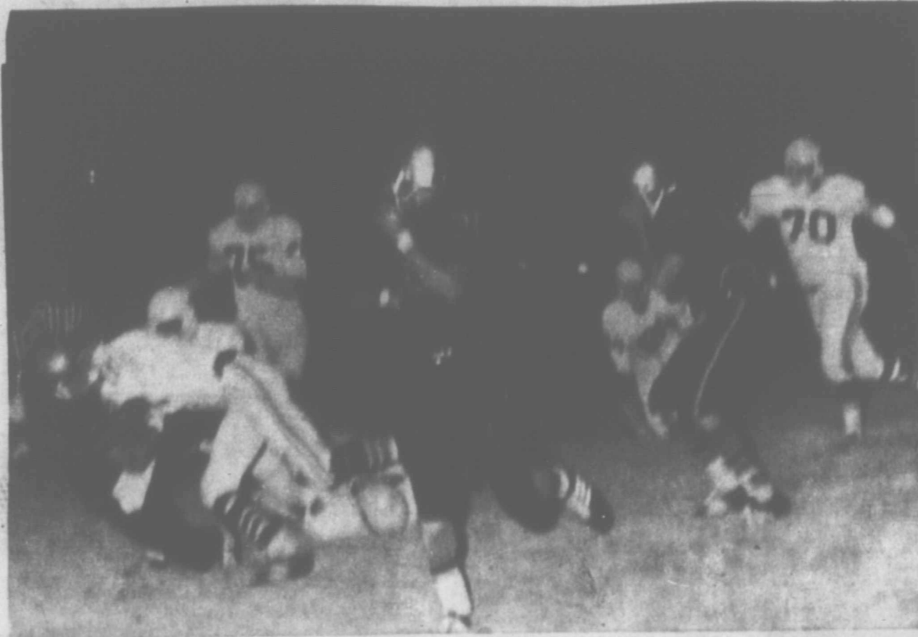
MUSTANGS HIT HARD - Several of the Bovina Mustangs ganged-up to down a member of the swarming Hornets at Bovina Friday night. Back the Hornets to topple the Steers here tomorrow night.