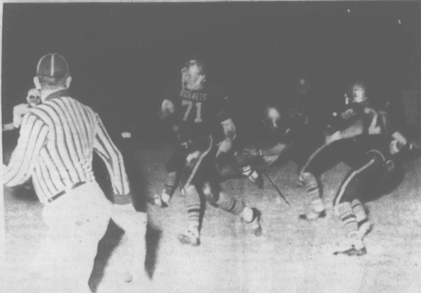
FUMBLE, FUMBLE-Shown above is one of the several fumbles which occurred during the Sudan Bovina game Friday night. Sudan was the victor, 39-26, although they led by a greater margin until the last minute of the game. This gives Sudan a 4-1 conference record and will take on Farwell here tomorrow night. Farwell also has a 4-1 record, being defeated only by the Kress Kangaroos.