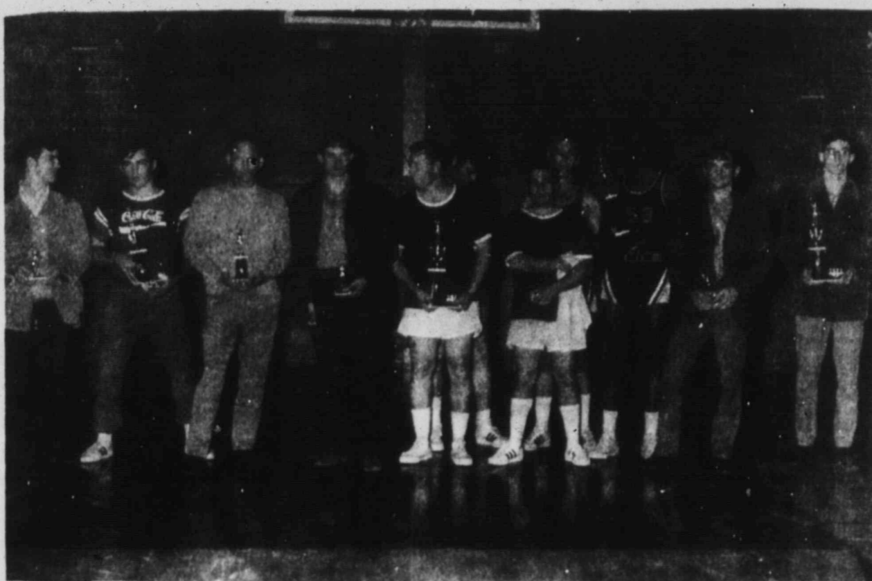
ALL TOURNAMENT PLAYERS AND TROPHY WINNERS

All members are urged to attend with each being asked to bring a salad and pie.