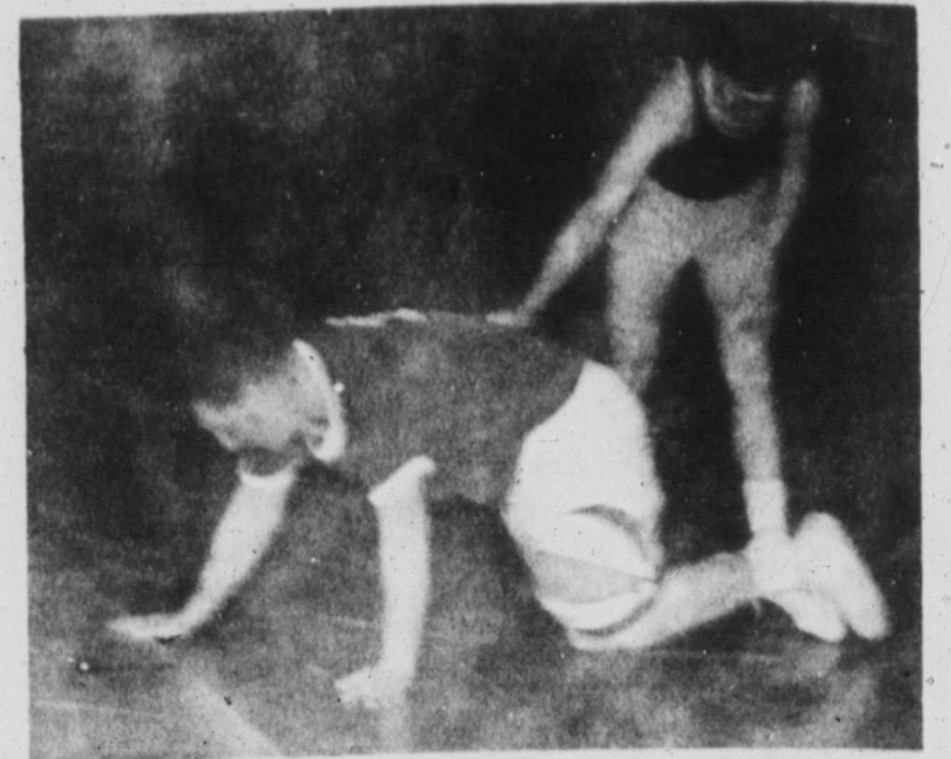
ANYBODY FOR A RIDE? - The above photo was taken Saturday during the recent Tournament.