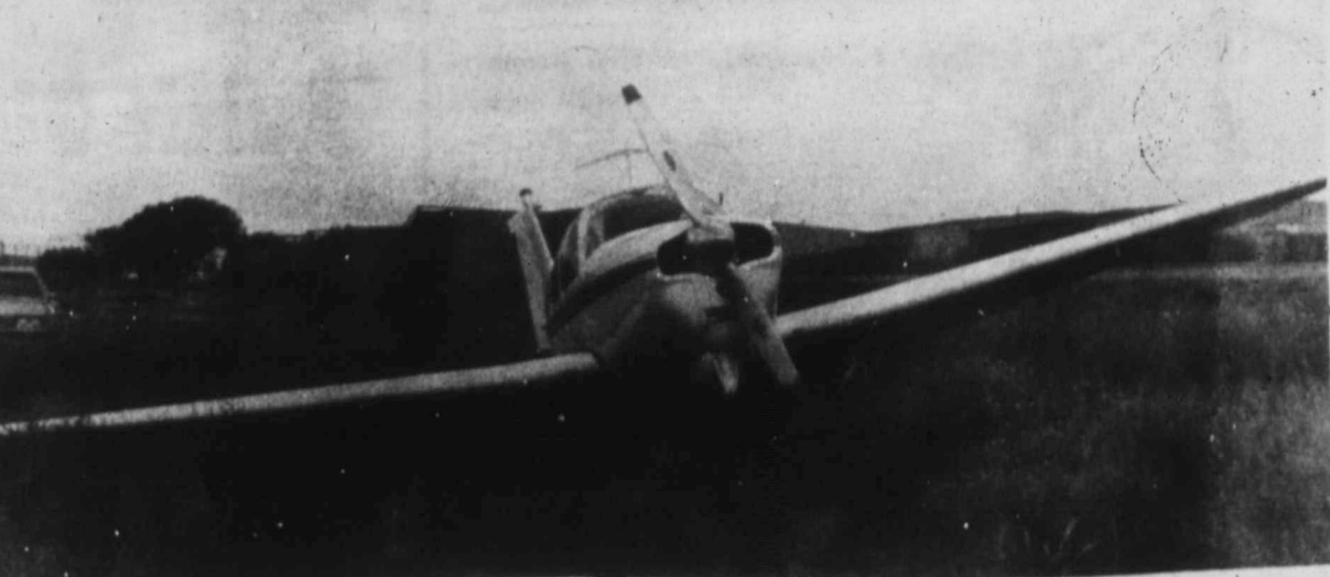
OUT OF GAS - The above plane had to make an emergency landing on the Union Compress yard early Tuesday morning. with the pilot and six passengers aboard. None of the passengers were injured.

The prospective bridegroom is a 1968 graduate of Springlake-Earth High School and a Senior Math major at Texas Tech Un-