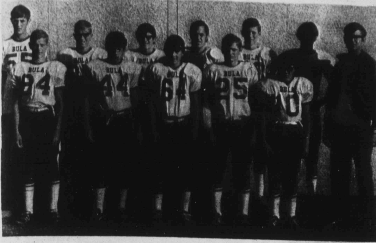
BULA BULLDOGS, DISTRICT WINNERS FOR SIX-MAN FOOTBALL

THE SUDAN BEACON NEWS WEDNESDAY, NOV. 24, 1971