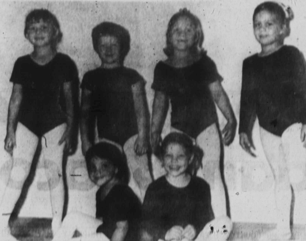
BALLET SMILES -- Six ballet students of Tutu King's School of Ballet are shown while taking time out for a Beacon News photo.

3609 34 St., Lubbock, Texas Phone 799-9124