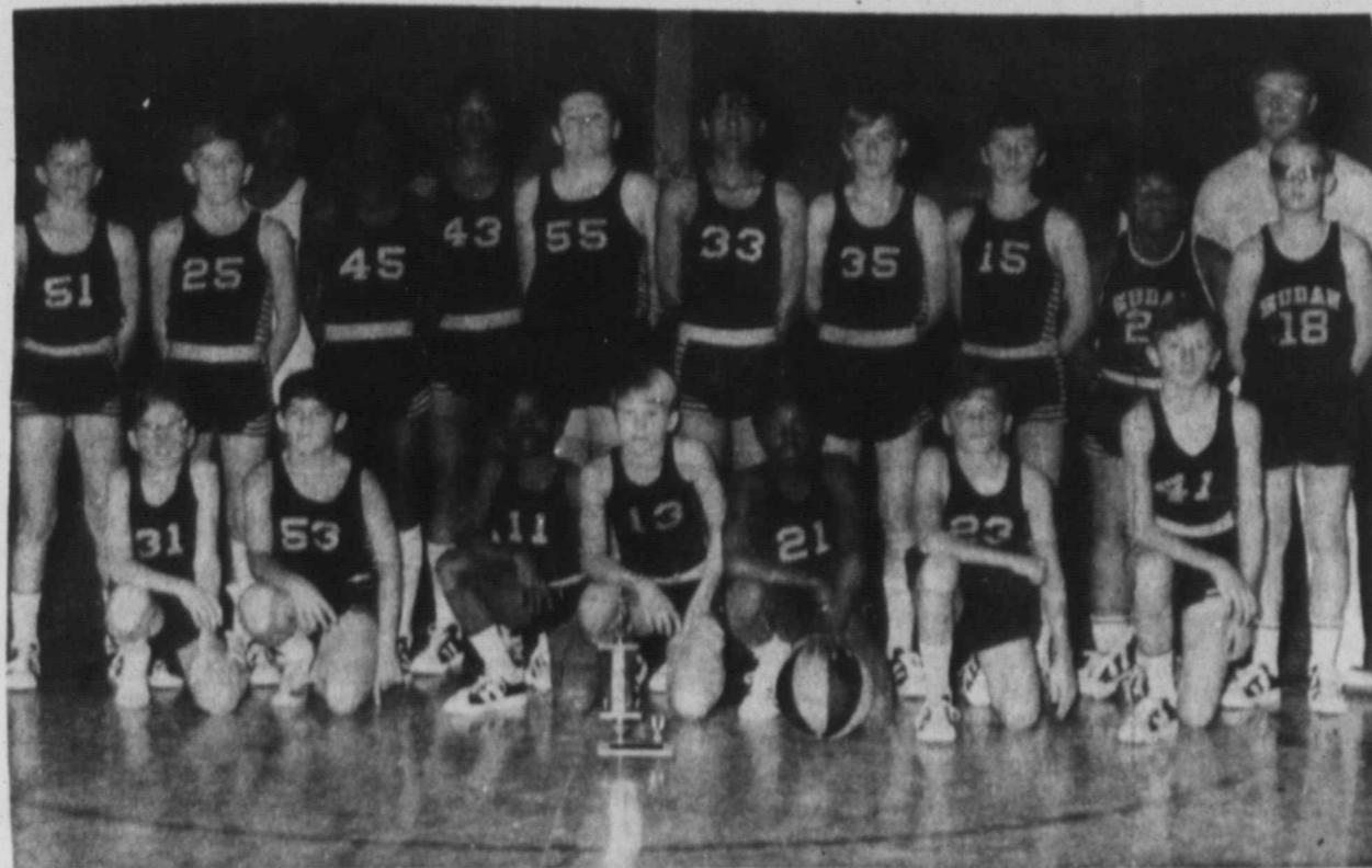
SHOWN Above is the seventh grade boys basketball team with the trophy they won in the Bula tournament last week.

"The demand for lumber and forest products caused by the record-breaking number of hous-