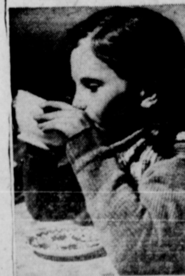
Small refugee finds food and comfort in a new home provided for her by a member agency of the National War Fund.