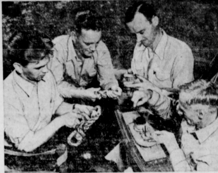
Though they've gambled with death in the performance of their duty these merchant seamen can't forget the sea, even on a holiday. Here they are recuperating at one of the many rest centers which the United Seamen's Service, a member agency of the National War Fund, maintains here and abroad, in cooperation with the War Shipping Administration.