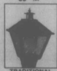
TRADITIONAL BLACK 59" H.