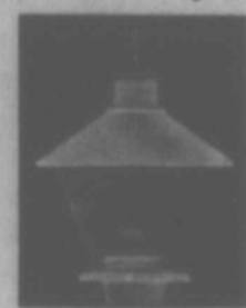
LAWN-GLO WHITE 69" H.