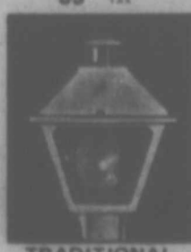
TRADITIONAL WHITE 59" H.