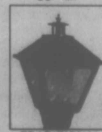
TRADITIONAL BLACK $9 95