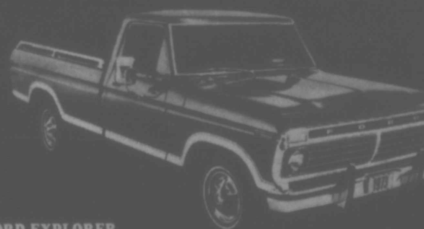
'73 FORD EXPLORER PICKUP