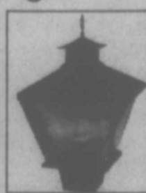
LAWN-GLO BLACK 69" H.