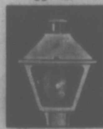
TRADITIONAL WHITE $9 95