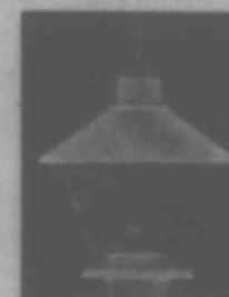
LAWN-GLO WHITE $9 95