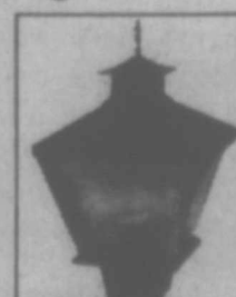
LAWN-GLO BLACK $9 95