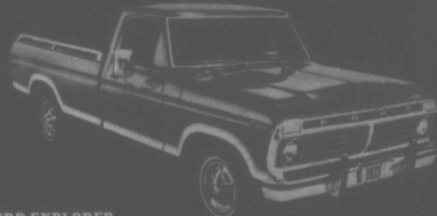
'73 FORD EXPLORER PICKUP