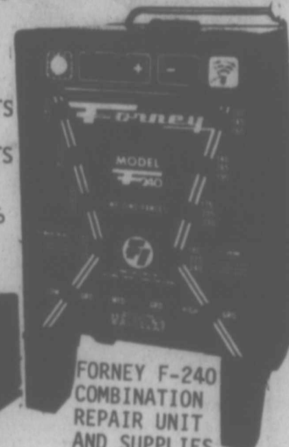
FORNEY F-240 COMBINATION REPAIR UNIT AND SUPPLIES

HAVE GOOD SELECTION 8-TRACK STEREO TAPES