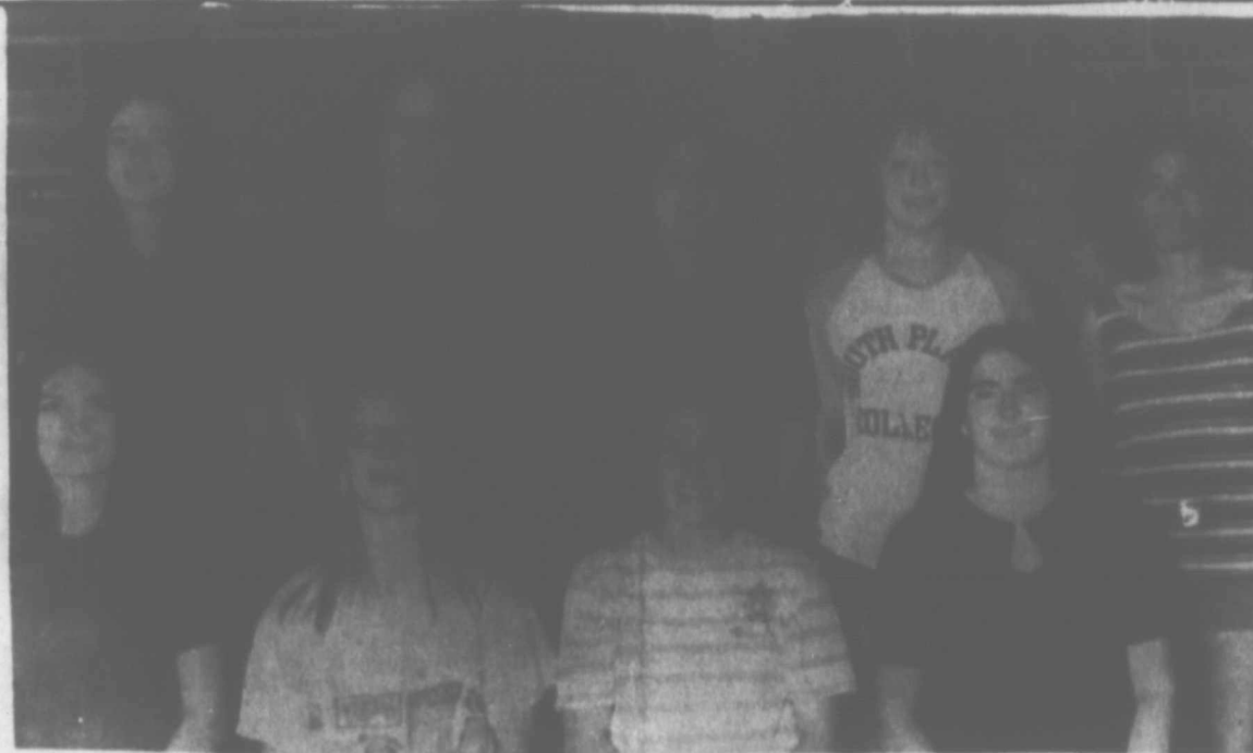
SHOWN ABOVE is the 1974 Hornette Volleyball team who recently won second place in District play.