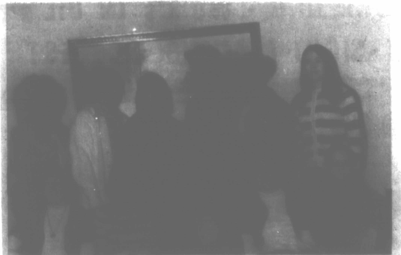
FNA WEEK OBSERVED--Pictured above are the girls who recently attended the National FNA Week Convention held in Lubbock.