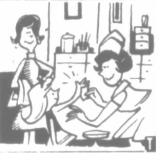
There are more than two

In the United States today, there are some 28,000 people working as trained health care workers. In hospitals, corporations, dining facilities, school cafeterias and homes of the disabled, they are responsible for both individual and large-scale nutritional decisions.