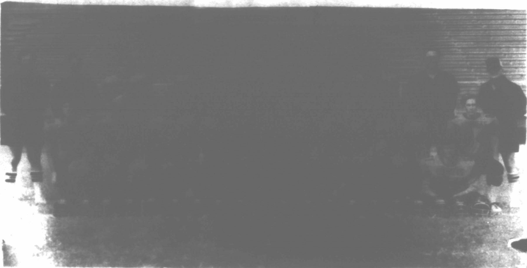
THE SUDAN HORNETS VARSITY FOOTBALL TEAM