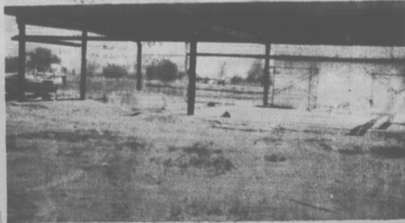
ABOVE IS PICTURED one of the buildings under construction here in Sudan. Chester Irrigation Office is

Next one will be April 22nd at 7 p.m. in the Sudan School Cafeteria. Free admission. Confession stand.