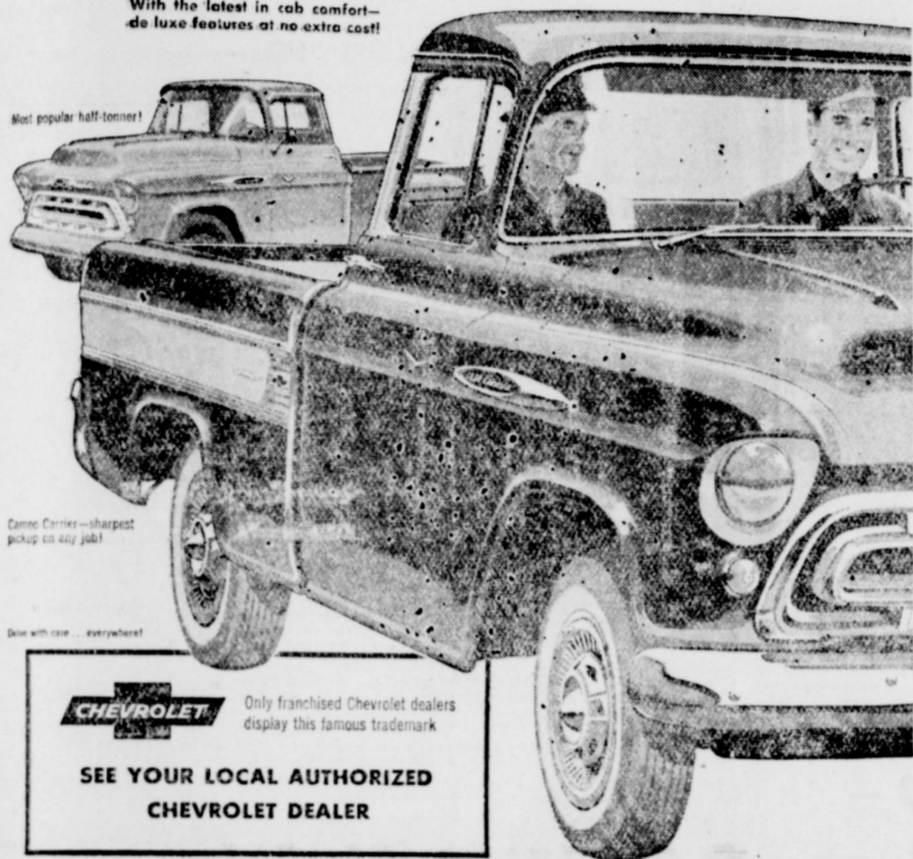
Most popular half-tonner!

With the latest in cab comfort—de luxe features at no extra cost!