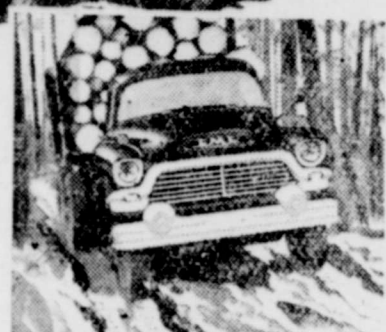
HUG-DEEP RUTS, soft ground, down and up ravines, it totes a Herculean payload day in and day out in the timberlands of North Carolina. Five trips a day, six days a week the year around—and it stays a stranger to the repair shop!

Illustrated: GMC 370 rated 19,500 GVW—22,000 with optional H.D. front axle, 206-hp V8 or 140-hp Six.