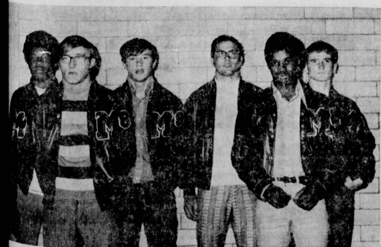
CEIVE DISTRICT HONORS . .

Many of the kids have already sent in their letters—so you had better hurry and get yours in too! No matter how many there are, Jolly old Santa will read every one of them and you will be able to seeyour own letter when it is published in the Christmas edition of the Tribune on December 23.