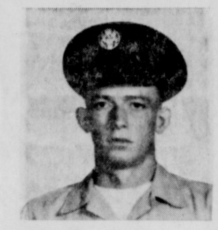
COMPLETES BASIC . . .

radio spots, slides, TV series, records, etc.