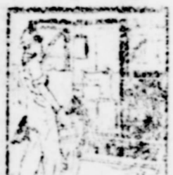
Machine seat for luggage by raising rear seat and upholstery