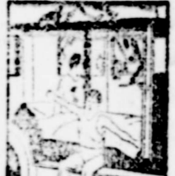
Seat and upholstery make into comfortable bed full length of car