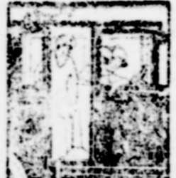
Big doors front and rear—no folding seats—no rear climbing