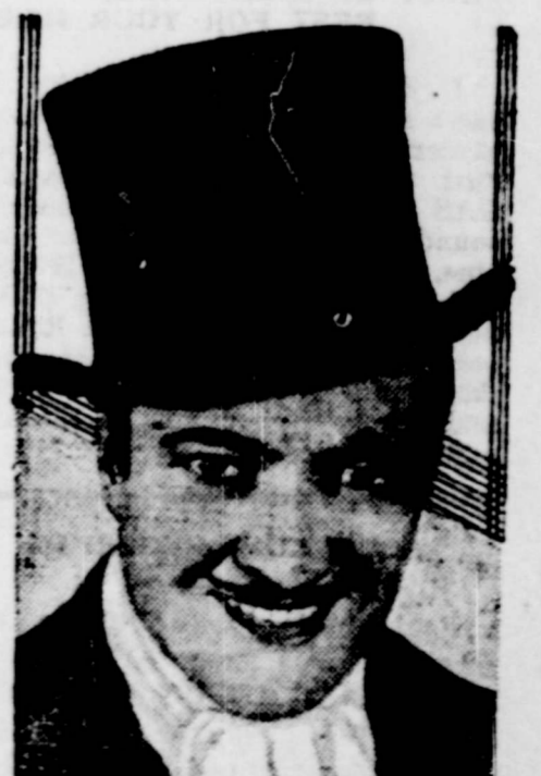
Edmund Lowe in the Fox Movie-tone drama, "Scotland Yard"

By studying the past we can get a pretty accurate idea of the future.