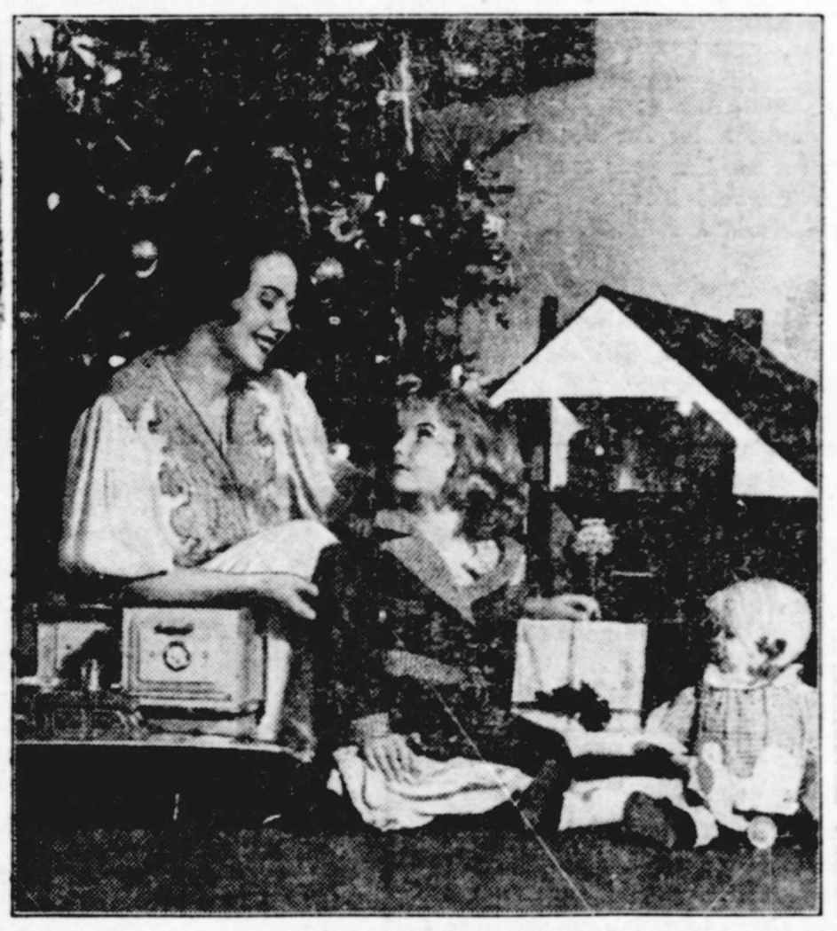
A picture like this will become a most cherished possession a few years hence. Begin your picture record now.