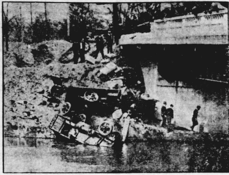
The above scene shows the finale of a crash between two trucks...

safety regulations. Civic and trade organizations and the public generally are being stirred into action to "do something about it."