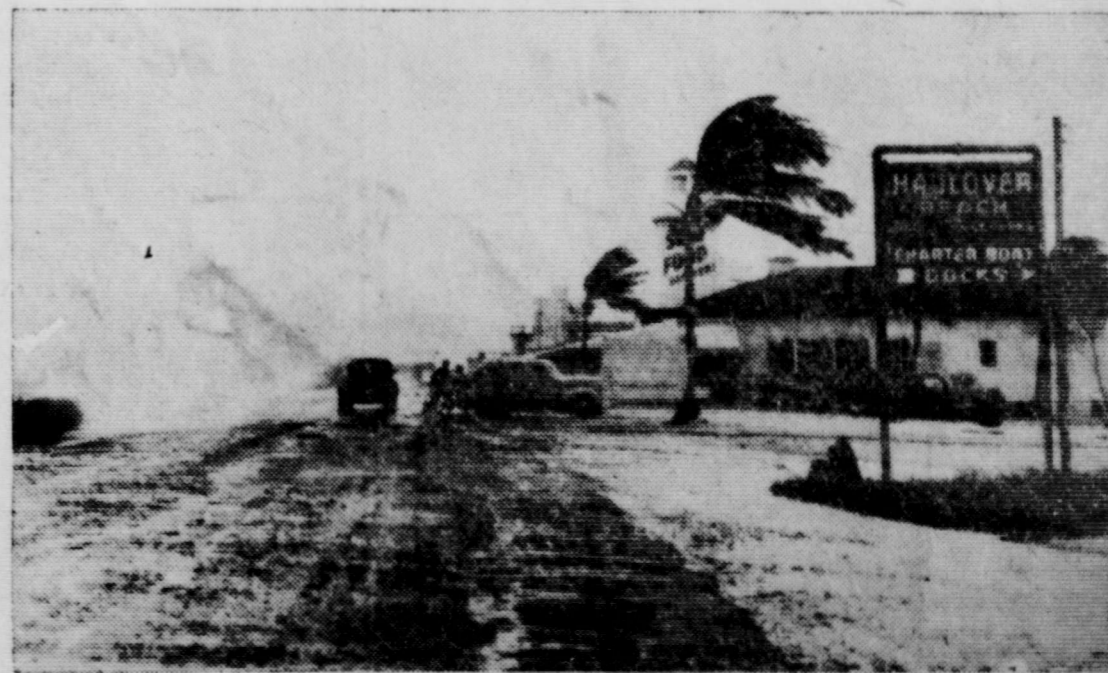
Heavy waves lash the road at Bakers Haulover at Miami Beach, Florida, as a violent hurricane picked up speed to put the extreme South Florida coast in danger zone. The blow is expected to hit Cuba late in the afternoon of September 20.