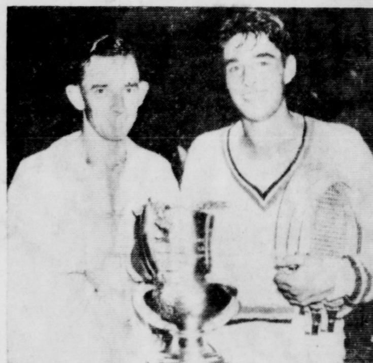
Richard (Pancho) Gonzales, right, holds trophy after he defeated South Africa's Eric Sturges, left, at Forest Hills, New York, to take the National Amateur Tennis Championship. Pancho took the match in straight sets, 6-2, 6-3, 14-12.