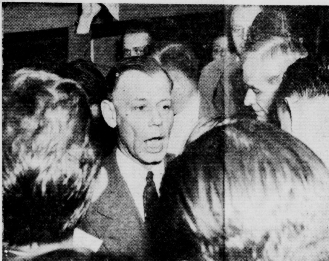
Walter Bedell Smith, U. S. Ambassador to Russia is swamped by newsmen as he enters press car aboard the Presidential train, enroute from Dallas, Tex., to Bonham, Tex. Mr. Smith flew to Dallas to confer with President Truman over the gravity of the Russian situation.