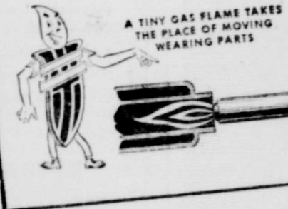
A TINY GAS FLAME TAKES THE PLACE OF MOVING WEARING PARTS