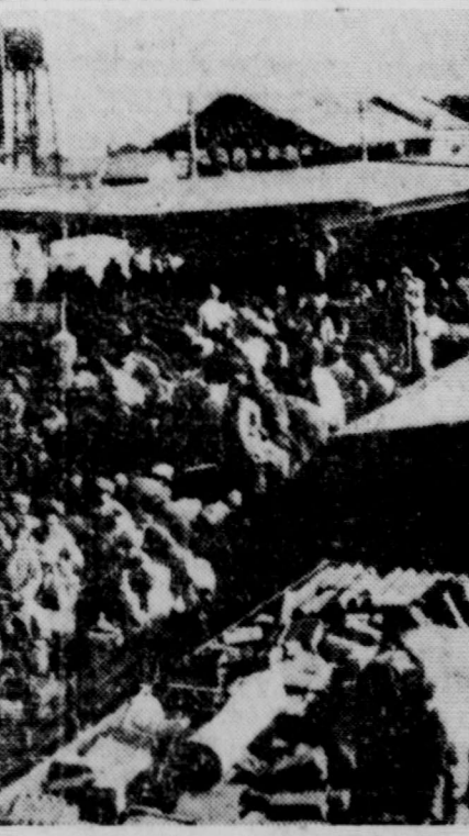
Nationalist ammunition train, right, passes a freight jammed with civilian refugees attempting to get out of the Pengu area in advance of the Communist drive. A terrific battle was raging near the city.—(NEA Telephoto).