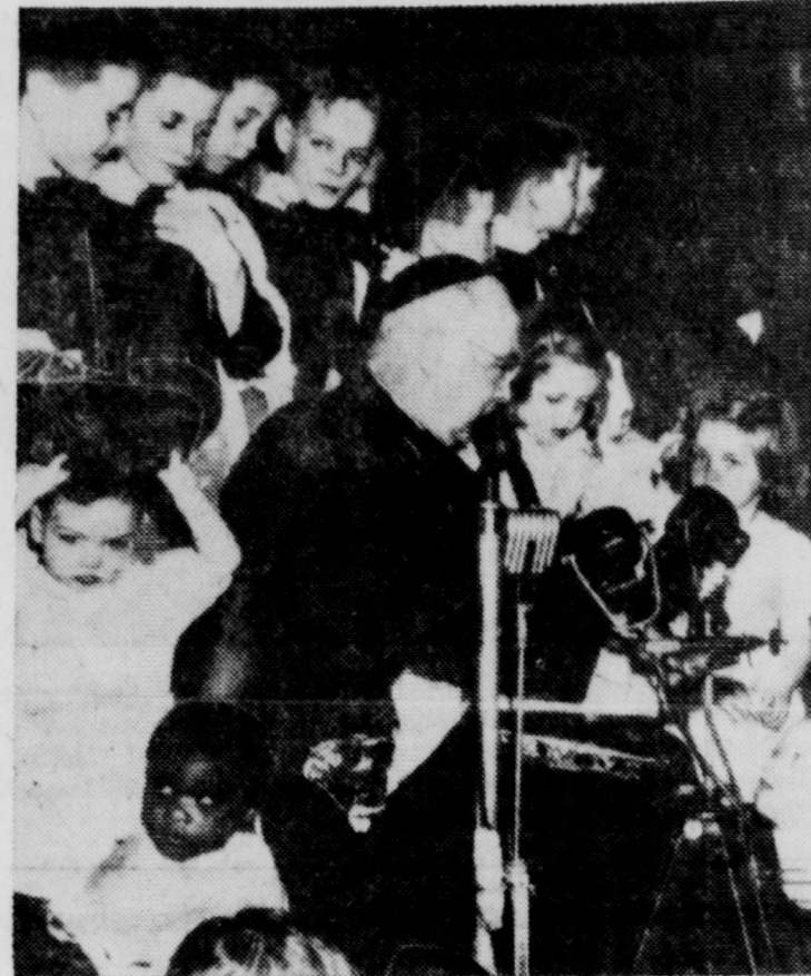
Cardinal Spellman, presents Christmas packages to youngsters from the New York Foundling Home during the annual Christmas party at the Waldorf-Astoria. He seems unaware that the tiny tyke on the left has picked himself an extra-special present. The little fellow is trying on Cardinal Spellman's biretta, perhaps just for size.