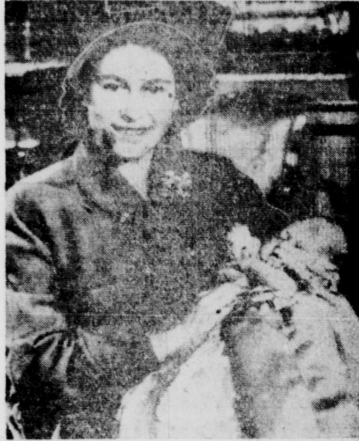
Princess Elizabeth holds her infant son, Prince Charles of Edinburgh, during christening ceremonies for the child in London.