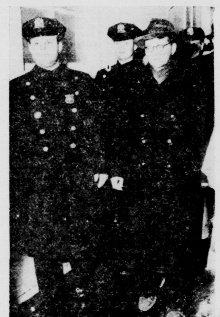
Russian composer, Dmitri Shostakovitch, right foreground, leaves LaGuardia Field in New York surrounded by a special police escort. The noted composer is in New York for a Cultural and Scientific Conference for World Peace...

While entries in the cattle and other divisions of the Eastland County Livestock Show held in Cisco Friday and Saturday were curtailed by the heavy rain Friday morning, the horse show and the auction sale Saturday turned out to be the leading events of the annual exposition.