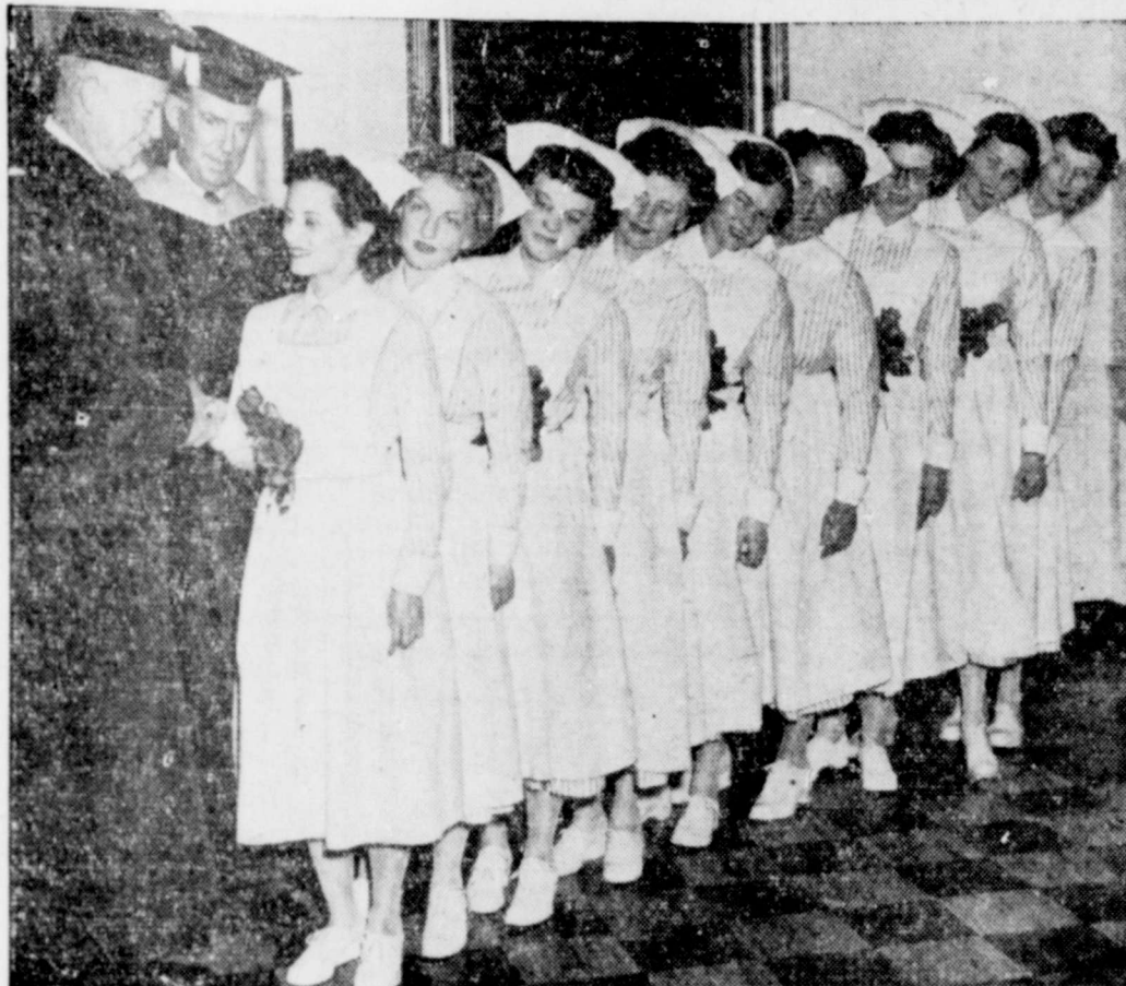
IKE GREETS FORMER BUDDIES—At the 55th graduation of the Presbyterian Hospital School of Nursing, in New York, Gen. Dwight D. Eisenhower, left, greets nine graduates who had served in the Armed Forces and later studied under the GI Bill of Rights.