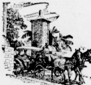
Old City Gate, St. Augustine

This superb blend of choice Ceylon and India teas has the fine fragrance and hearty flavor preferred by the Southern tea lover. Ask your grocer for Maxwell House Tea today.