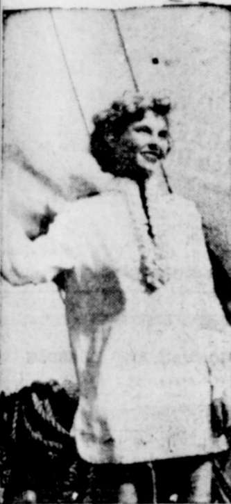
This eye-catching cotton shirt has been dubbed a "gremlin," and quite a cute gremlin it is. Designed in Lonsdale pique by Clifford of the Mar, the gremlin makes an ideal beach jacket.