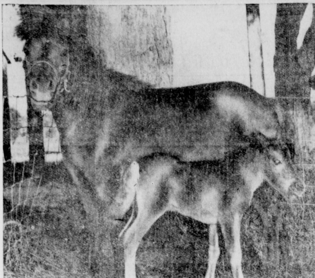
ALL MIXED UP —The neighbors around Lisbon, N. Y., were amazed when it was announced that this little colt had been foaled by a large farm horse. The colt measured 22 inches in height and weighed 25 pounds at birth. After some investigation, it was discovered that the mother was the Shetland pony, standing behind the youngster, and little pony colts come that small.