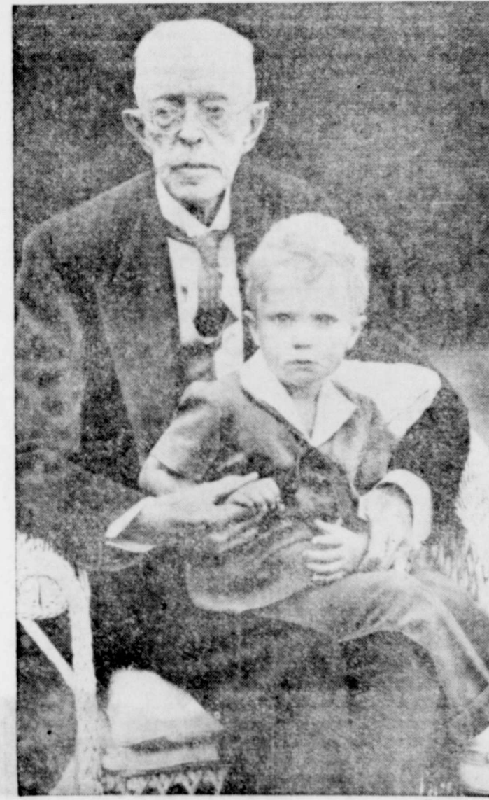
FOUR ROYAL GENERATIONS—While spending his vacation at his summer residence on Oeland Island, in Sweden, King Gustav received a surprise visit from his great-grandchildren. Here he poses with Carl Gustaf, 3, second in succession to the throne after his grandfather, the Crown Prince.

The rain was beneficial to peats and fall grains as well as late gardens. Cotton growers reported that the rain fell so slowly that little damage to open bolls was evident. The harvest was underway in most sections. Only a few inches of water was caught in Lake Cisco due to the dry condition of the watershed.