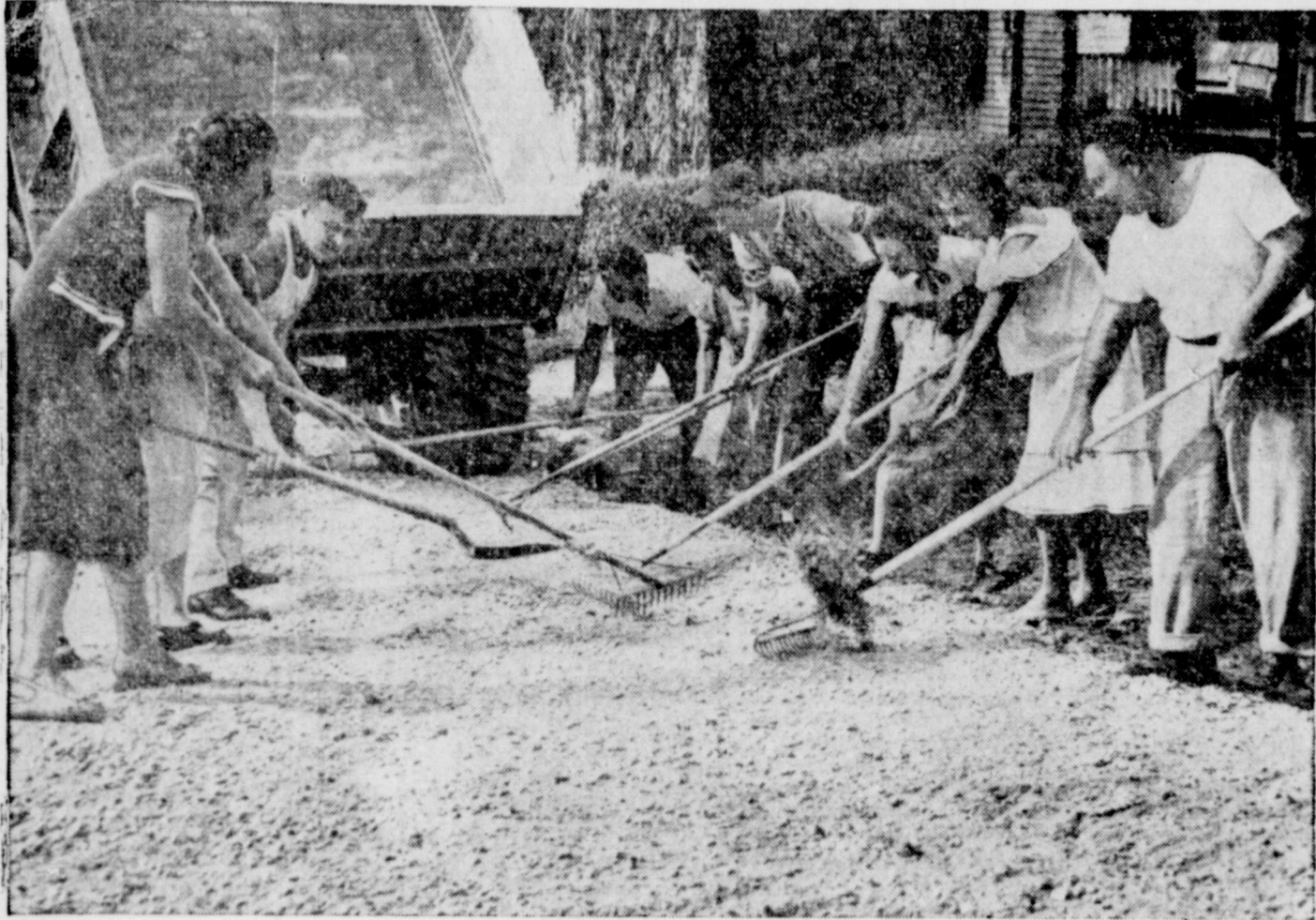
THEY DO IT THEMSELVES—These exasperated citizens in St. Louis, Mo., finally got tired of waiting for the highway department to fix the street in front of their homes. When the mailman threatened to stop deliveries down the neglected street, this pick and shovel brigade went to work. For four evenings they worked three hours each, and everyone contributed $5 to buy repair materials.