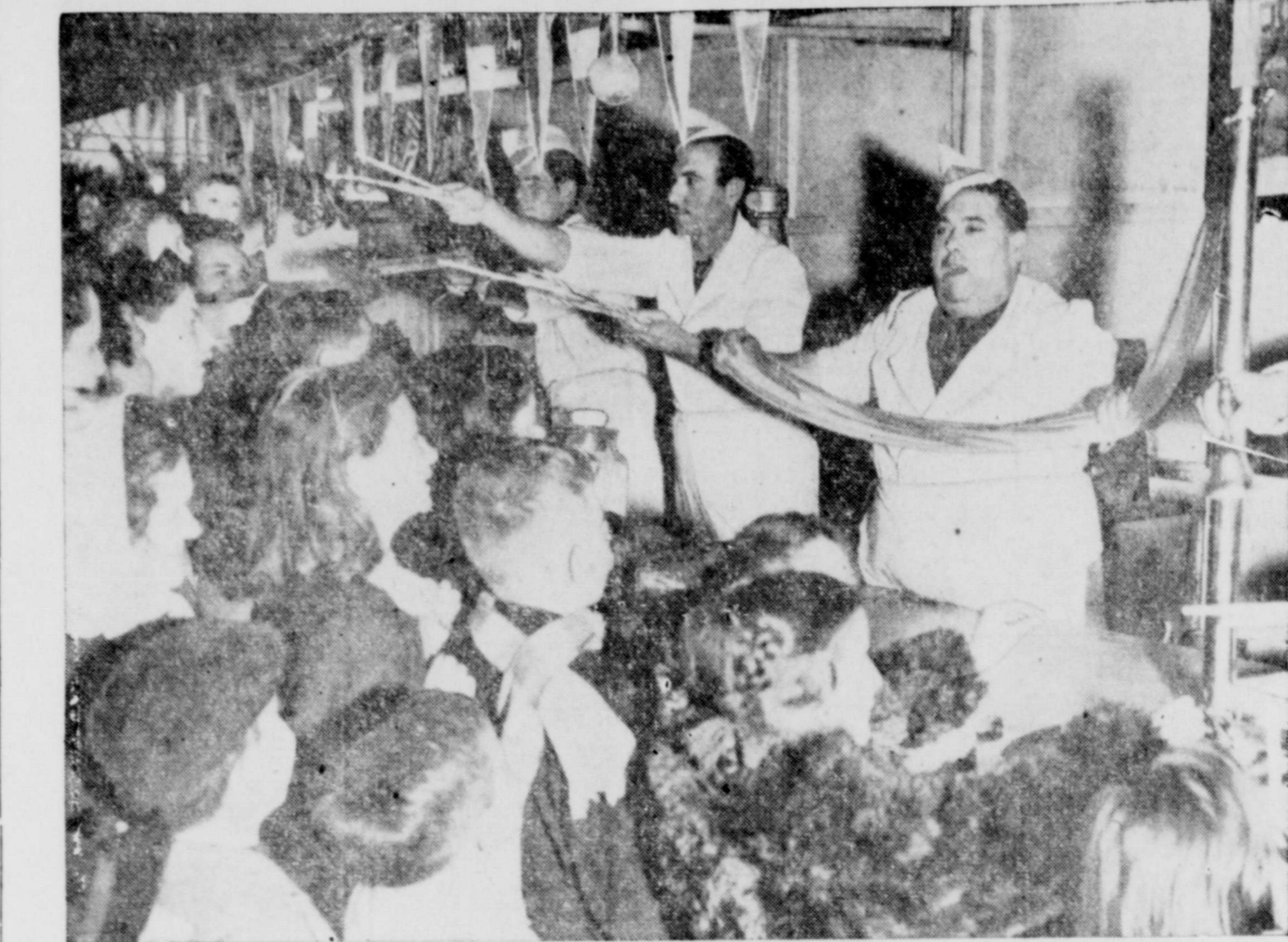
KIDS' PARADISE —Gathering around this candy vendor on the Piazza Navona, in Rome, Italy, are Roman children who flocked to the Square before Epiphany. Toys were also displayed to make the Square a children's paradise for a few weeks.