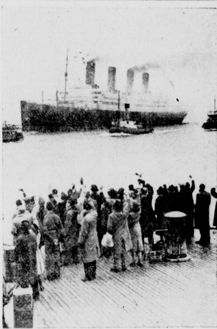
LAST TRIP—Onlookers wave farewell as the 45,000-ton liner Aquitania moves out of the harbor in Southampton, England, on her way to the breakers yard in Clyde to be demolished. The last of the Atlantic Queens of the Twenties, the 35-year-old vessel was honored by other ships in the docks which hoisted farewell signs.

Save 20 per cent on Appliance Loan Borrow From Your Bank. 1ST NAT'L in Cisco—Mr. F. D. I. C.