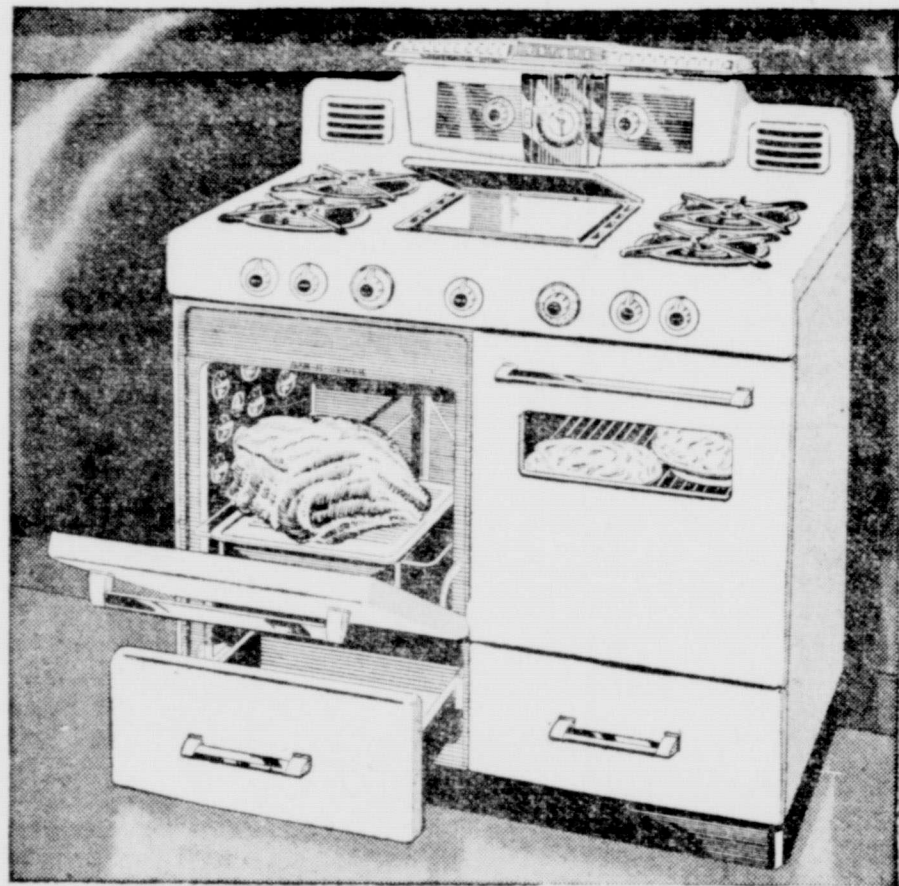
The ANTOINETTE Estate... Model 494

Imagine... getting Sunday dinner ready all at once... without rushing!