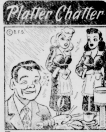
Platter Chatter HE SAID IT WAS THE LOBSTER THAT PINCHED ME.

From seafood to salad, you'll like the way we prepare tasty dishes. If foods are in season we have them — always fresh, always delicious.