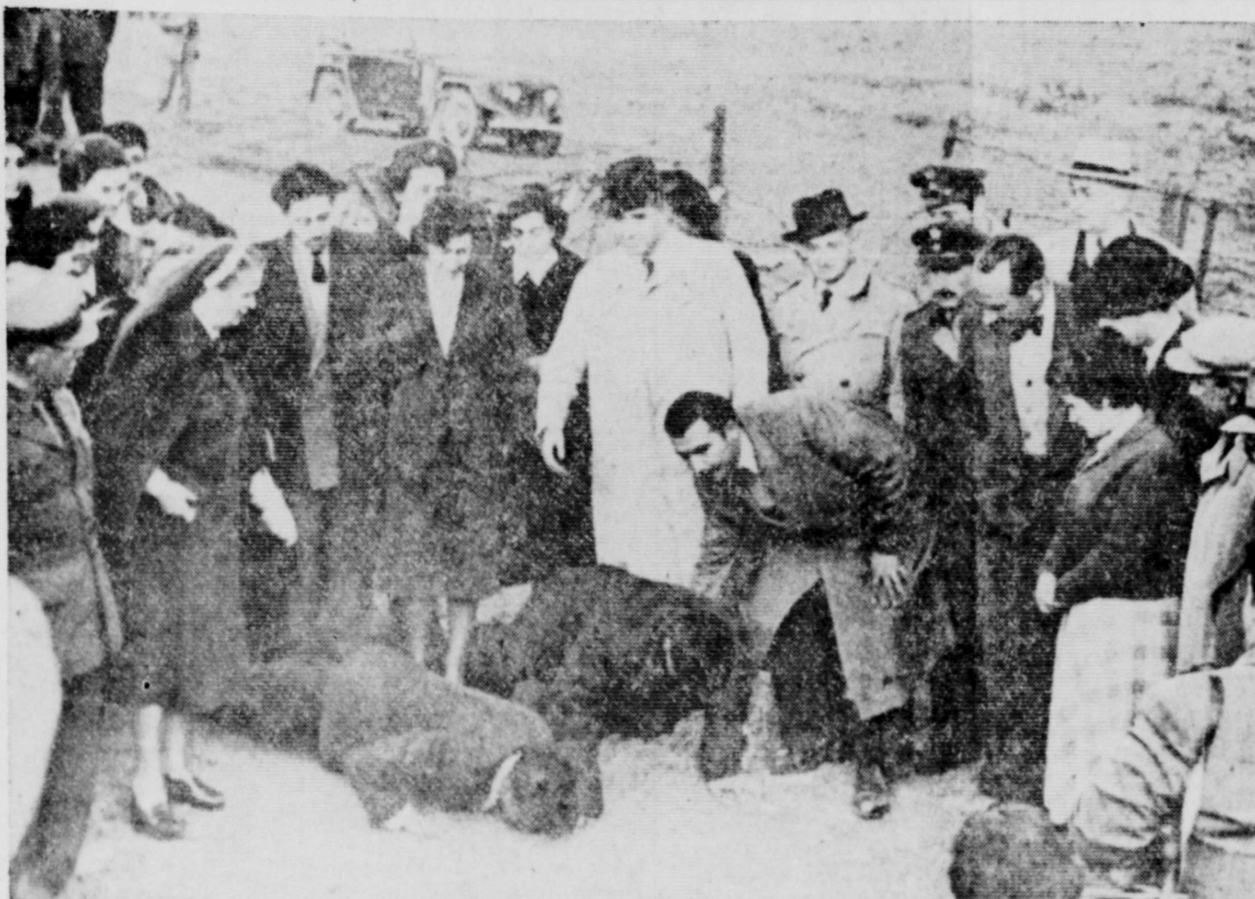
BACK TO FREEDOM—Two Greek youths, held in Yugoslavia for more than two years, kiss the soil of their native land after crossing the border at Evoznoi. They were returned to Greece in accordance with the repatriation program for children abducted by Greek Communists during the Civil War, and held in Yugoslavia. It's a wonderful Christmas season for them.