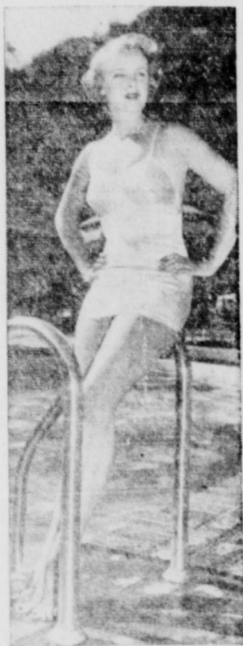
EASY LIVING —Petite Mona Freeman relaxes after a swim at a pool in Hollywood. With no thoughts of snow or overcoats, the young actress can bask happily in the California sun and not worry about what's going on weather-wise throughout the rest of the country.

The home was beautifully decorated throughout. The mantle with red candles and gold letters was decorated in ivy and berries