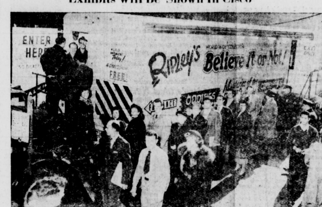
Spectators line the sidewalk, waiting to enter Robert Ripley's "Believe It or Not!" mobile Odditorium. Admission to the exhibit is free to the public, although voluntary donations to support Disabled American Veterans' activities are accepted. Inside the Odditorium is an amazing display of curiosities and oddities, collected by Robert Ripley during his world travels. The traveling exhibit will be brought to Cisco on Tuesday, Jan. 16, by the Cisco Chapter No. 74 Disabled American Veterans.