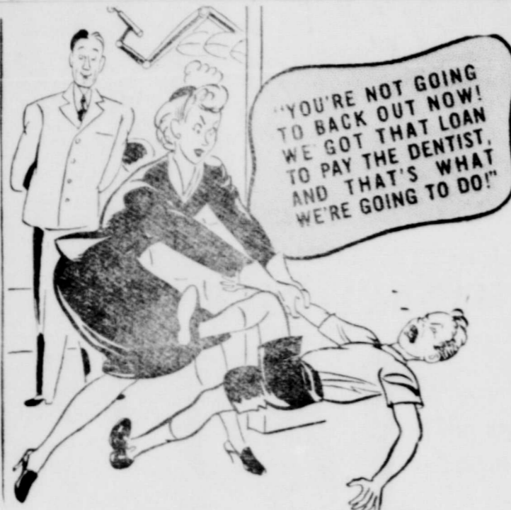
Many people get low-cost Personal Bank Loans here for dental, medical and other similar purposes.