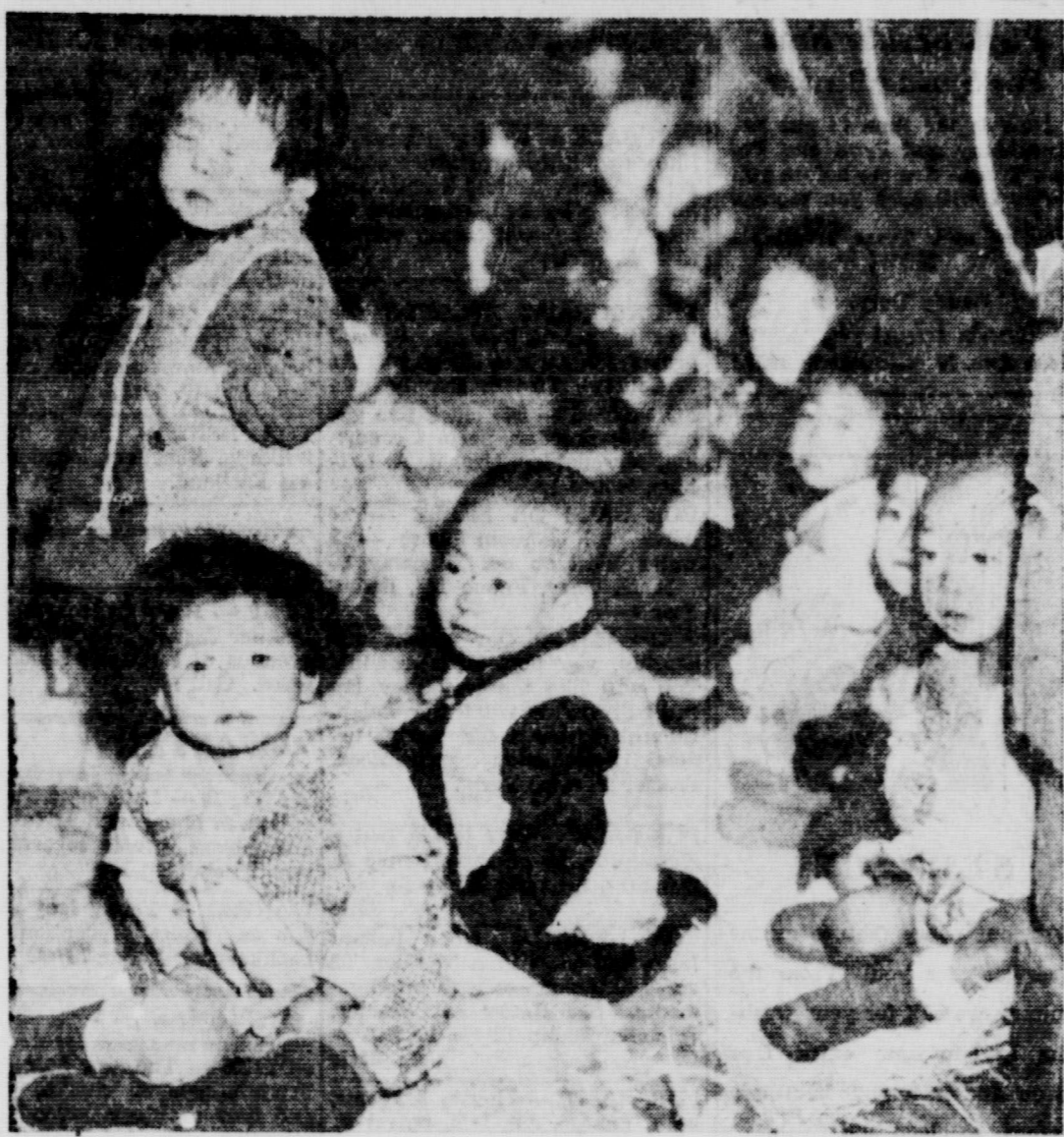
RESULT OF WAR—Bewildered Korean war orphans wait in the fuselage of a giant C-54 transport for evacuation to safety in South Korea. More than 1000 children were taken out by air while thousands of others, old as well as young, went as best they could.