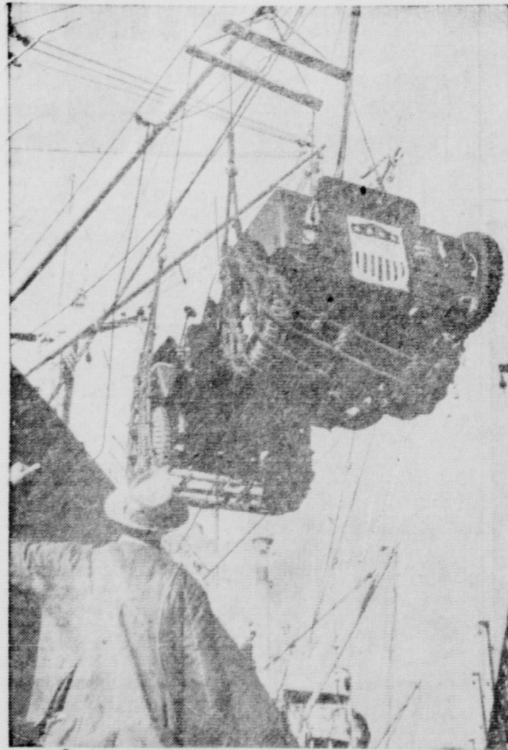
HOW DEMOCRACY WORKS —A jeep, destined for a Marshall Plan country in southeast Asia, is being hoisted aboard ship in Baltimore, Md., as the U. S. continues its shipments of food and machines to the nations outside the Iron Curtain. A new slogan, "Strength for the Free World—from the United States of America," is on the U. S. shield on the vehicle which will be used for ECA health projects.