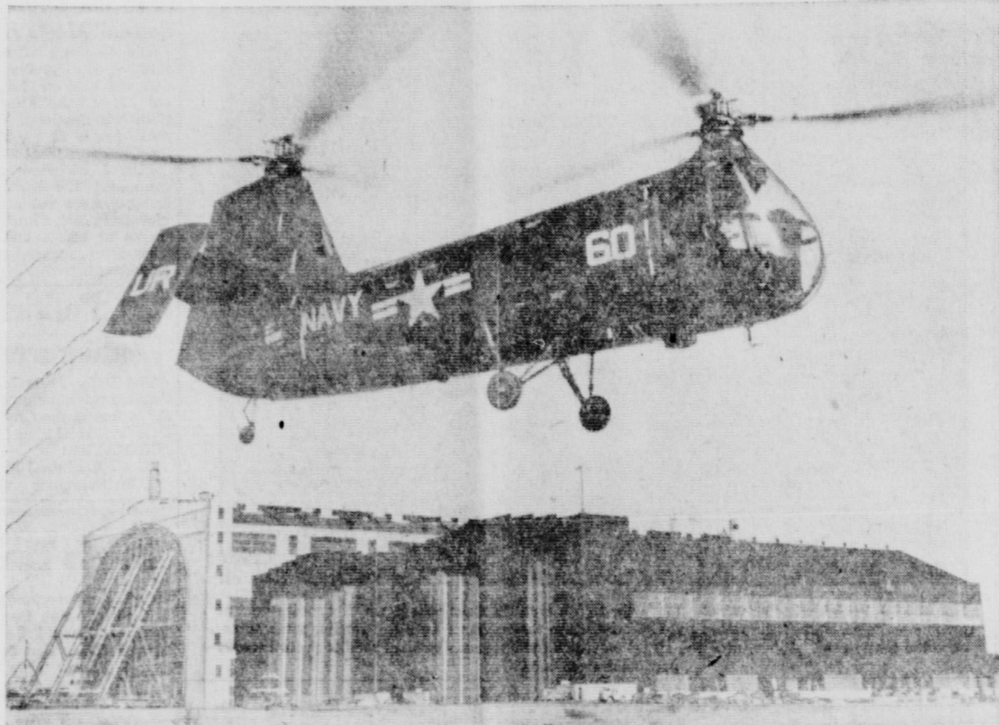
SOMETHING NEW —The Navy's newest helicopter, the Piasecki HUP-1, is shown making its first service flight as pilots of HU-2 Helicopter Squadron, Naval Air Station in Lakehurst, N.J., get checked out in the high-performing shipboard helicopters. Large numbers of HUP-1's are on order for a wide variety of fleet uses.