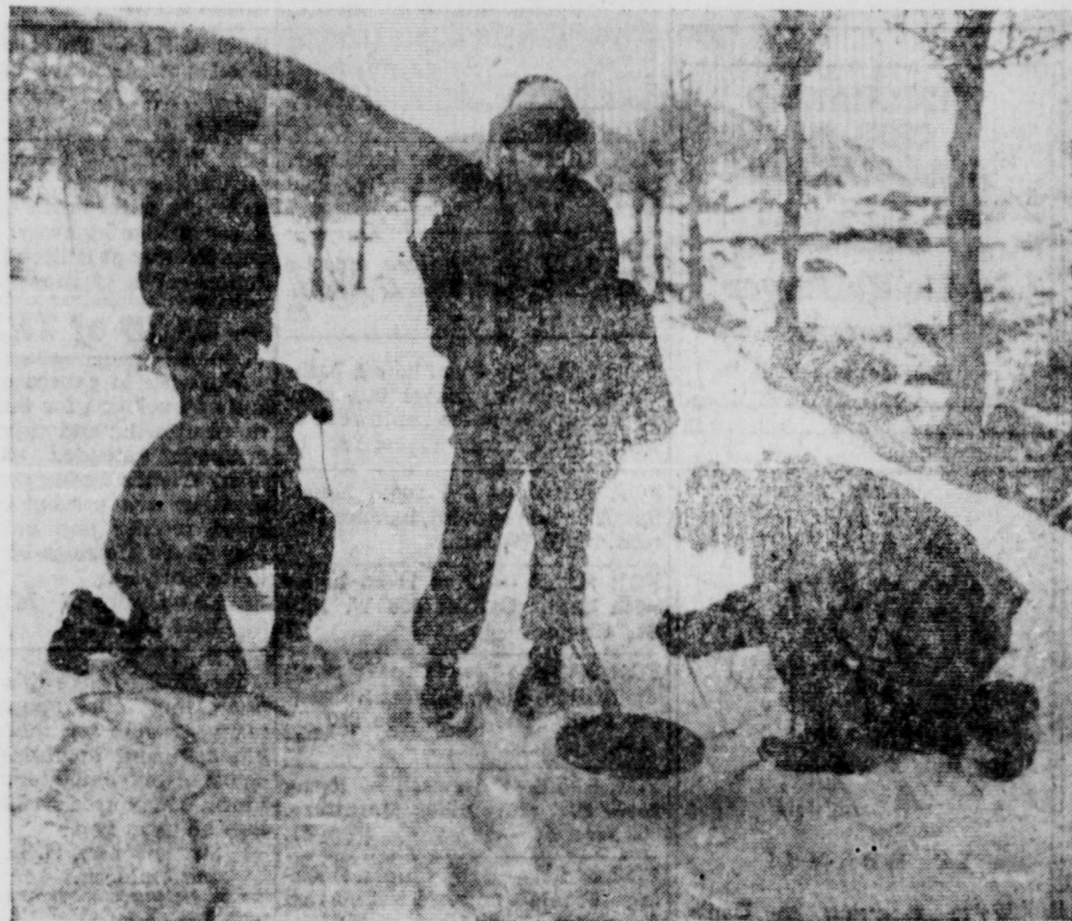
TAKE IT EASY!—U. S. engineers, cautiously handling a mine detector on a road in South Korea, are on the lookout for explosives buried by the Communists. An unlucky GI can easily be blown to pieces if he happens to step on one of the mines planted for that purpose.