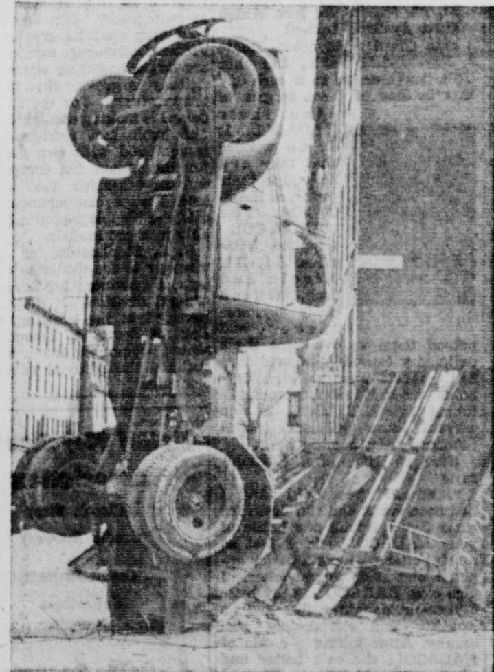
NICE ON A COLD DAY—The driver of this truck in Philadelphia, Pa., was supposed to be using the dump truck to deliver a load of coal. When he went around a corner, the weight of the coal called the turn, set the driver on his back, spilled out then and there and delivered the driver unhurt but riding high. And that settles the question of which end was running the truck.

The High School Coronation ceremonies scheduled for Friday, February 16, have been postponed due to the weather. The event is scheduled for Friday, February 23.