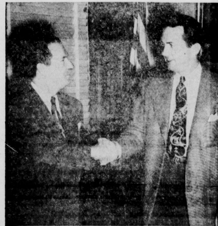
SHIVERS GREET'S ECONOMY COMMISSION DIRECTOR