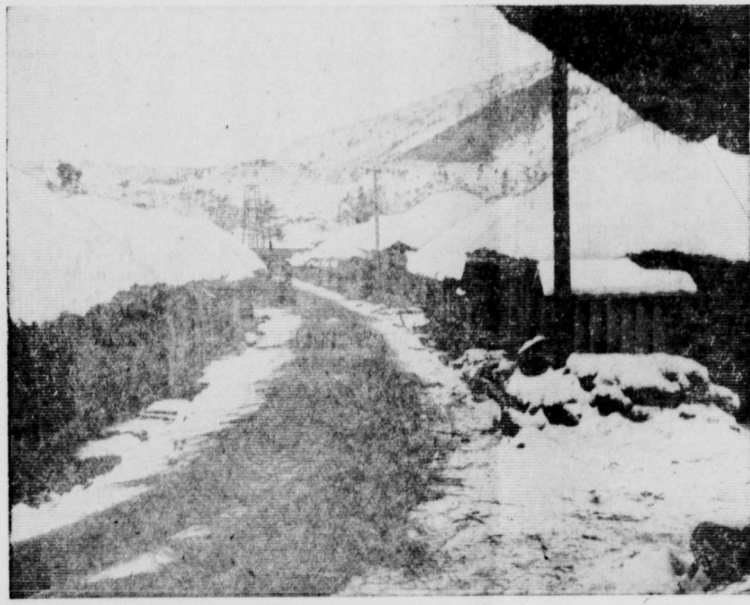
DESERTED VILLAGE—UN vehicles move through a South Korean village which appears void of civilian activity. Most of the villages are deserted since the residents have fled farther south to escape the battle zone. Above, note the straw placed on the icy, snow-covered road to protect trucks and tanks from skidding.