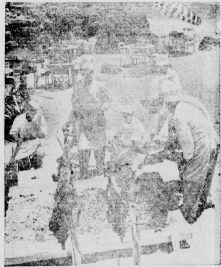
DINING OUT—A bevy of chefs in S. Juan, Puerto Rico, puts the finishing touches to the favorite native picnic—roast suckling pig, spitted for several hours over a coal fire. The fortunate guests will eat it at tables on the beach, followed by a siesta in the sun and all the swimming they can take.