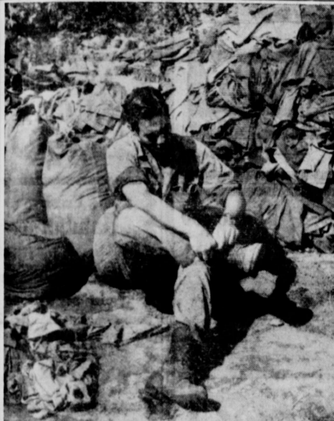
NOW'S HIS CHANCE—During a two-month period of capturing, losing and recapturing "Heartbreak Hill," this Second Marine Division leatherneck, along with the rest of his unit, went without clean clothes, showers, or haircuts. But now he's getting ready to add his bit to the pile of dirty clothing behind him.