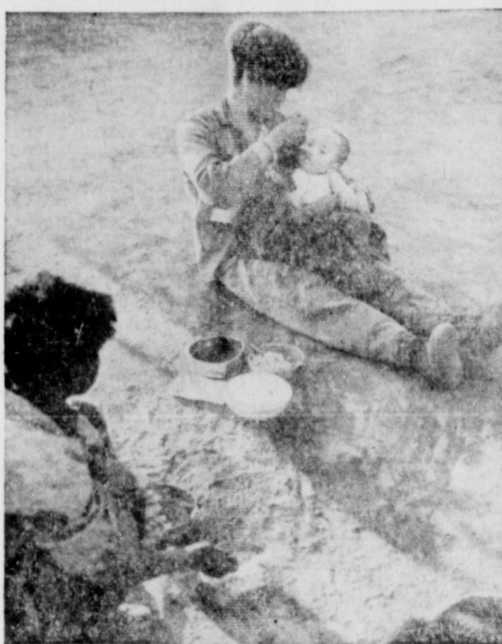
A COMMON BOND—Sitting on the ground at a small camp for homeless South Koreans, near the central front, this man feeds a helpless orphan who's much too small to do it by himself. Even as the war continues to rage, rehabilitation of its victims goes on with orphanages set up wherever possible to take care of the overflow of homeless children.