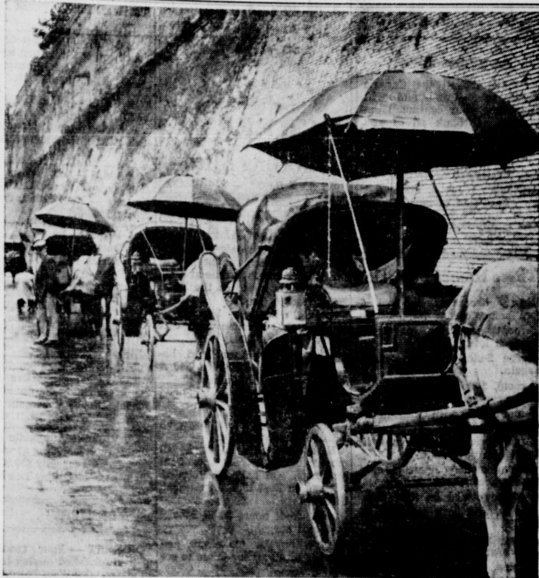
WAITING IN THE RAIN —A steady rainfall in Rome, Italy, doesn't keep the horse-drawn cabbies from hoping. As they wait at various places throughout the city for tourists whose sightseeing isn't curtailed by the weather, they huddle under large black umbrellas and keep dry.