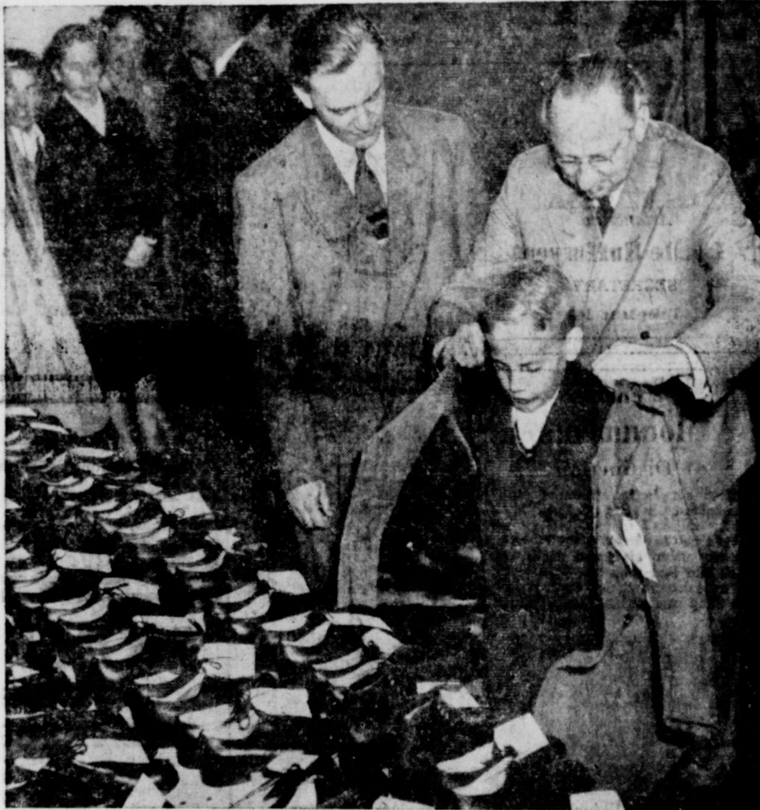
FOR THE KIDS —West-Berlin Senator for Social Affairs Otto Bach fits a coat on a needy German child as Martin Sandberg, of Norway and Deputy Chief of the United Nations International Children's Emergency Fund, looks on. The presentation was made at commemorative ceremonies for the founding of the UN staged by the German Senate in the U.S. sector of the city.