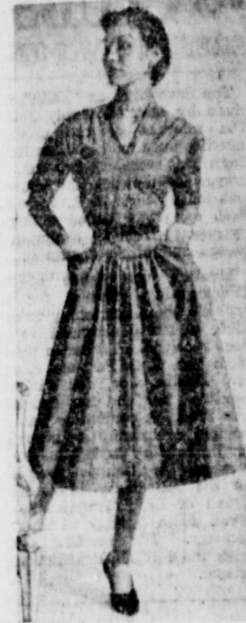
TAKING AIRS —A cotton moire, make-it-yourself dress for daytime or datetime features interesting touches at the full, gathered skirt, the roll-collar neckline and the push-up sleeves. The dress can be worn all through the Autumn and Winter.