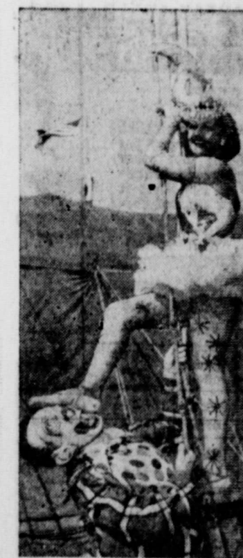
SARONG TO CIRCUS —Dorothy Lamour is shown indulging in some off-set play in Hollywood with Buzzy Potts, a clown with the Ringling Bros. Circus. Doty and other top Hollywood stars appear as circus performers in Cecil de Mille's new film, "The Great Show on Earth," and they look mighty convincing, too.