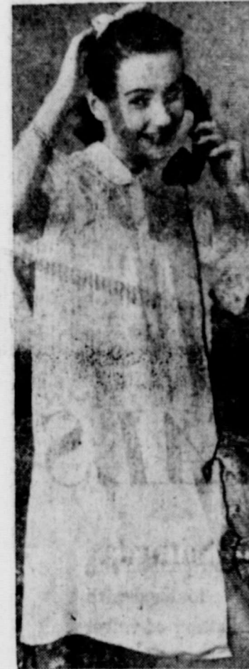
SHORTIE —Feminine frills on top and nothing below the knee is Dora Gottlieb's prescription for comfortable sleeping. Imported lace, daintily applied in scroll pattern, makes a peek-a-boo yoke and trim little collar.