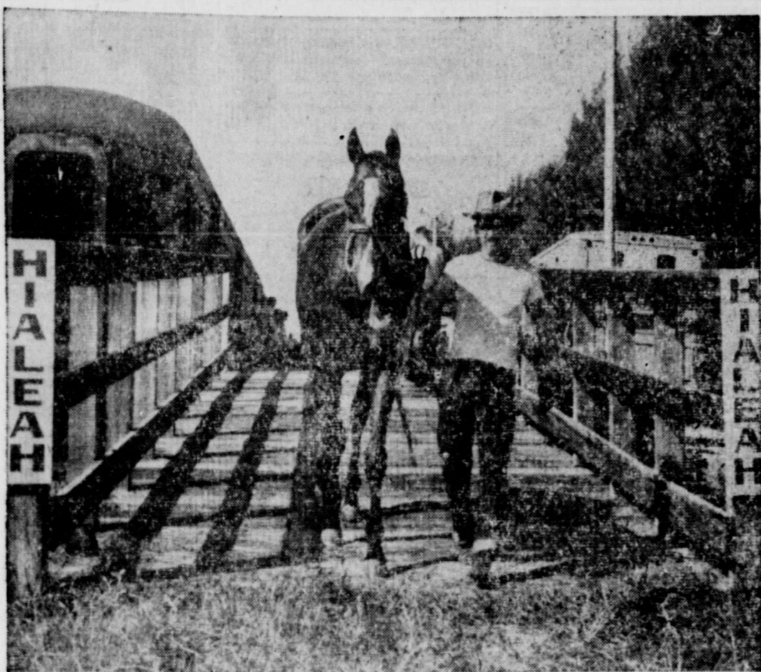
OFF TO THE RACES—The first thoroughbred led off the loading platform at Florida's Hialeah Park race track was Low and High. As most Northern tracks approached their final meets of the season, the balmy southern state opened its stables to neighbors from chillier regions.

If you spend a dollar at home you have some hope of getting it back; if you don't, you just spend a dollar.