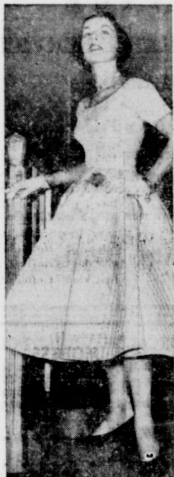
PARTY QUILTING —Quilted pink silk taffeta makes this simple, yet attractive, informal party dress. Designed by Anne Fogarty in New York, it features a wide, rounded neckline, fitted bodice and a very full skirt to delight the fashion sense of the discriminating.