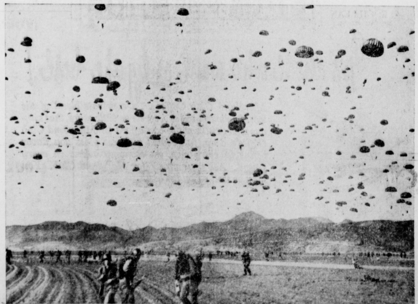
COMING DOWN FOR A LANDING —Paratroopers of the 187th Regimental Combat Team descend in Operation Show-off, a gigantic training exercise involving Army and Air Force men and equipment in Korea. Far East Air Force C-119's and C-46's airlifted about 3000 troopers from Japan and unloaded the jumpers in a maneuver that simulated full combat conditions.