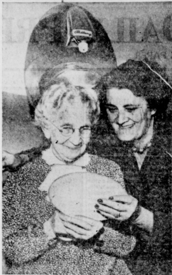
100TH BIRTHDAY AND NEW HAIRDO—Beauty operators in Minneapolis, Minn., dropped in at the Walker Methodist home to give a free coiffure to any resident who wanted one.

Indiana has made public the names on the relief rolls. Texas should take similar action at the next session of the Legislature.