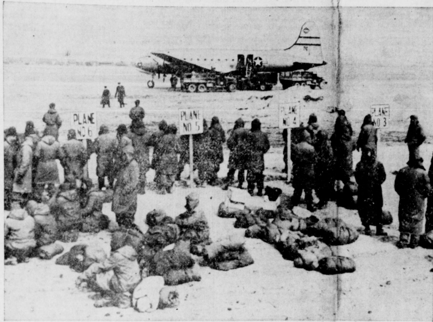
IT WON'T BE LONG NOW —Battle-weary UN ground force soldiers patiently wait to board the plane which will fly them to leave areas in Japan. This shuttle service provides a two-pronged mission, flying vital war materiel to forward areas and returning with personnel. In the tightened-up plan, no space is wasted and exhausted GIs are cared for.