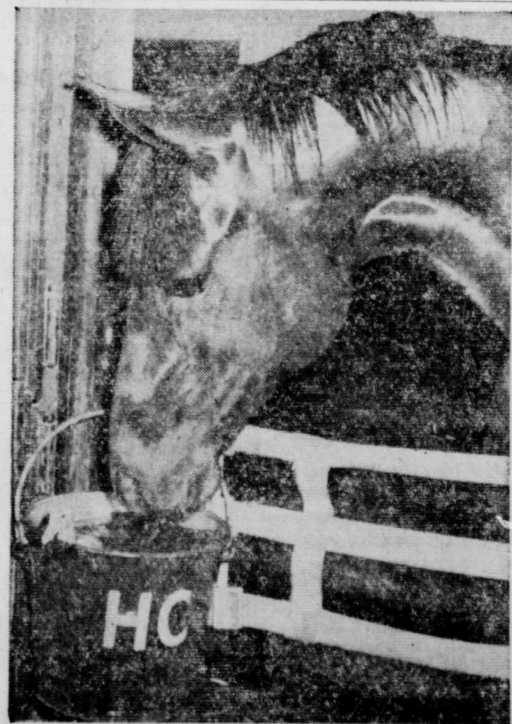
A STRANGE ASSORTMENT —Thoroughbred Realtor doesn't seem too perturbed about Donald, the duck, using the horse's water bucket for a private swimming pool in Miami. Donald is the web-footed mascot of a stables at Gulfstream Park.

FOR GOOD SERVICE on your Olds and Cadillac Osborne Motor Co. — Eastland